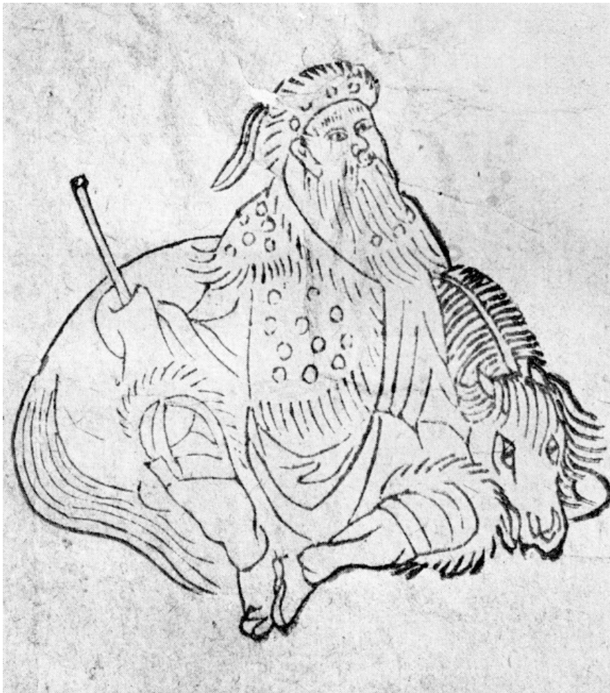
A KITAN TARTAR (14th Century)

Turning now to China, the famous House of Sung, the early years of which were so full of promise of national prosperity, and which is deservedly associated with one of the two most brilliant periods in Chinese literature, was founded in 960. Korea was then forced, in order to protect herself from the encroachments of China, to accept the hated supremacy of the Kitans; but being promptly called upon to surrender large tracts of territory, she suddenly entered into an alliance with the Nü-chêns, who were also ready to revolt, and who sent an army to the assistance of their new friends. The Nü-chên and Korean armies, acting in concert, inflicted a severe defeat on the Kitans, and from this victory may be dated the beginning of the Nü-chên power. China had indeed already sent an embassy to the Nü-chêns, suggesting an alliance and also a combination with Korea, by which means the aggression of the Kitans might easily be checked; but during the eleventh century Korea became alienated from the Nü-chêns, and even went so far as to advise China to join with the Kitans in crushing the Nü-chêns. China, no doubt, would have been glad to get rid of both of these troublesome neighbours, especially the Kitans, who were gradually filching territory from the empire, and driving the Chinese out of the southern portion of the province of Chihli.