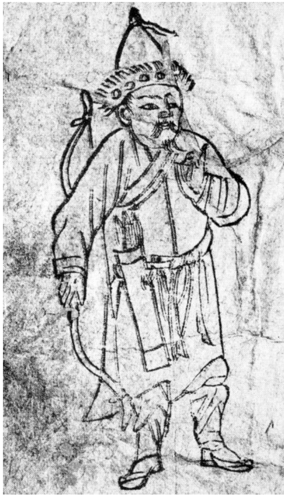
A NÜ-CHÊN TARTAR (14th Century)