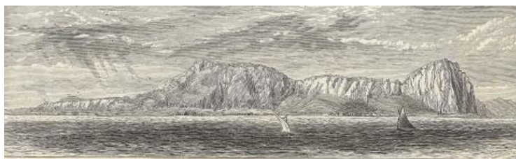
View of Gibraltar from the Bay.

"Now, Mr. Probert, you may as well take some of the sail off her. We will anchor inside those craft, close to the New Mole. They may want to get her alongside, to unload the government stores we have brought out; and the nearer we are in, the less trouble it will be to warp her alongside, tomorrow morning. Of course, if the landing place is full, they will send lighters out to us."