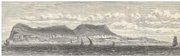
View of Gibraltar from the Mediterranean.

In another two hours the Straits were passed, and the Rock of Gibraltar appeared, rising across a bay to the left.