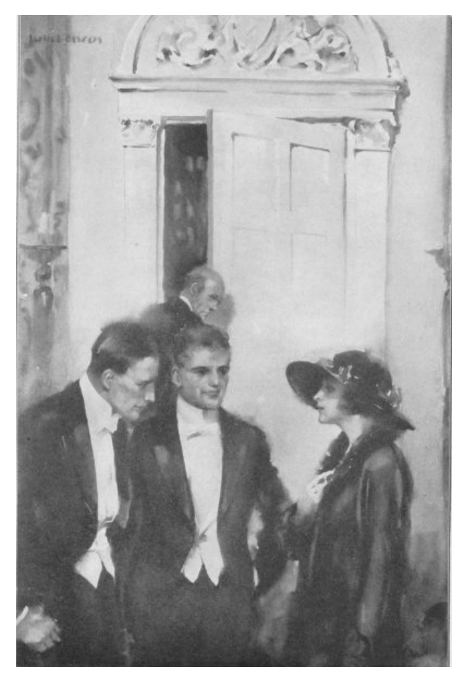
Her "Very glad, I'm sure," was uttered with reservations