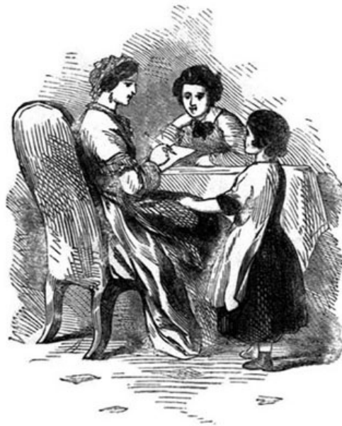
Writing the Notes.

*** START OF THE PROJECT GUTENBERG EBOOK THE BIRTHDAY PARTY: A STORY FOR LITTLE FOLKS ***