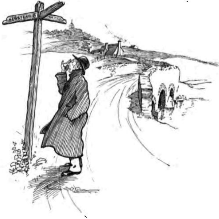
" WITH ITS HEAD TILTED BACK, STUDYING THE SIGNPOST."

The bewilderment on Mrs. Cox's face increased; she was trying to reconcile her husband's statement with a vision of a trim little figure which she had seen ten minutes before with its head tilted backwards studying the sign-post, and which she was now quite certain was Mr. Piper.