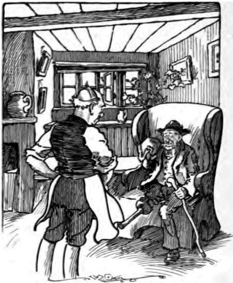
“WIPED HIS EYES TO THE MEMORY OF THE FAITHFUL BLACK.”

“Look here,” said Mr. Ketchmaid, putting down the bottle and regarding him intently, “you’ve got me fair. Now, will you go for a pound?”