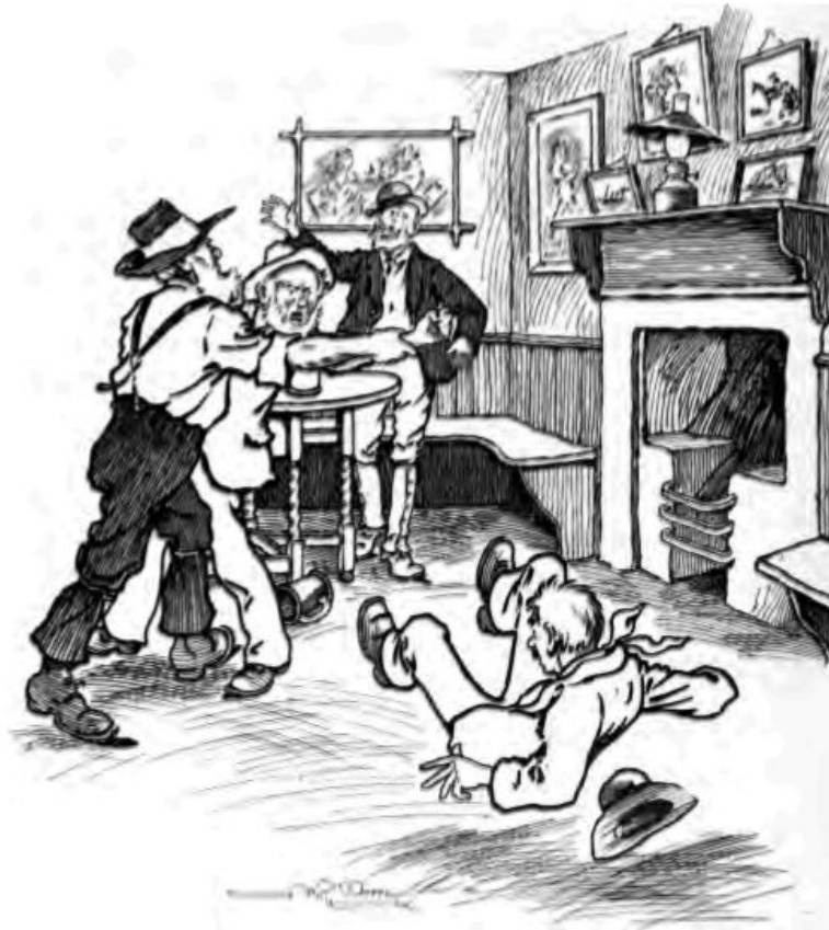
“ THERE WAS UNPLEASANTNESS ALL ROUND THEN.”

“And that wasn't the only unpleasantness, and at last some of the chaps put their 'eads together and agreed among themselves to try and help Job Brown to give up the drink. They kep' it secret from Job, but the next time 'e came in and ordered a pint Joe Gubbins—'aving won the toss—drank it by mistake, and went straight off 'ome as 'ard as 'e could, smacking 'is lips.