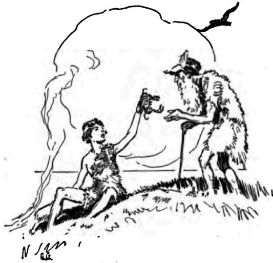
THIS ATTRACTED THE OLD MAN'S NOSTRILS

The change of his mood to one of joy was immediate. He snuffled and muttered and mumbled, making almost a croon of delight, as he began to eat. Of this the boys took little notice, for it was an accustomed spectacle. Nor did they notice his occasional exclamations and utterances of phrases which meant nothing to them, as, for instance, when he smacked his lips and champed his gums while muttering: "Mayonnaise! Just think—mayonnaise! And it's sixty years since the last was ever made! Two generations and never a smell of it! Why, in those days it was served in every restaurant with crab."