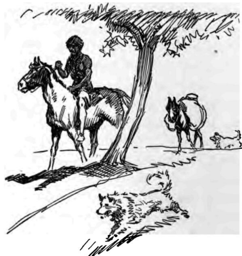
"WITH MY HORSE AND DOGS AND PONY, I SET OUT."

"There is little more to tell. With my two dogs and my pony, and riding a horse I had managed to capture, I crossed the San Joaquin and went on to a wonderful valley in the Sierras called Yosemite. In the great hotel there I found a prodigious supply of tinned provisions. The pasture was abundant, as was the game, and the river that ran through the valley was full of trout. I remained there three years in an utter loneliness that none but a man who has once been highly civilized can understand. Then I could stand it no more. I felt that I was going crazy. Like the dog, I was a social animal and I needed my kind. I reasoned that since I had survived the plague, there was a possibility that others had survived. Also, I reasoned that after three years the plague germs must all be gone and the land be clean again.