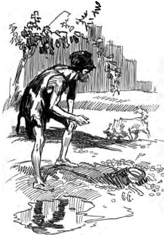
"I FOUND EVIDENCES OF A RECENTLY OCCUPIED CAMP"

"I LIVED three weeks of infinite torment there in the Chauffeur's camp. And then, one day, tiring of me, or of what to him was my bad effect on Vesta, he told me that the year before, wandering through the Contra Costa Hills to the Straits of Carquinez, across the Straits he had seen a smoke. This meant that there were still other human beings, and that for three weeks he had kept this inestimably precious information from me. I departed at once, with my dogs and horses, and journeyed across the Contra Costa Hills to the Straits. I saw no smoke on the other side, but at Port Costa discovered a small steel barge on which I was able to embark my animals. Old canvas which I found served me for a sail, and a southerly breeze fanned me across the Straits and up to the ruins of Vallejo. Here, on the outskirts of the city, I found evidences of a recently occupied camp.