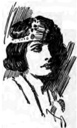
"VESTA, THE ONE WOMAN"

"I went on with him to his camp, and there I saw her, Vesta, the one woman. It was glorious and... pitiful. There she was, Vesta Van Warden, the young wife of John Van Warden, clad in rags, with marred and scarred and toil-calloused hands, bending over the campfire and doing scullion work—she, Vesta, who had been born to the purple of the greatest baronage of wealth the world had ever known. John Van Warden, her husband, worth one billion, eight hundred millions and President of the Board of Industrial Magnates, had been the ruler of America. Also, sitting on the International Board of Control, he had been one of the seven men who ruled the world. And she herself had come of equally noble stock. Her father, Philip Saxon, had been President of the Board of Industrial Magnates up to the time of his death. This office was in process of becoming hereditary, and had Philip Saxon had a son that son would have succeeded him. But his only child was Vesta, the perfect flower of generations of the highest culture this planet has ever produced. It was not until the engagement between Vesta and Van Warden took place, that Saxon indicated the latter as his successor. It was, I am sure, a political marriage. I have reason to believe that Vesta never really loved her husband in the mad passionate way of which the poets used to sing. It was more like the marriages that obtained among crowned heads in the days before they were displaced by the Magnates.