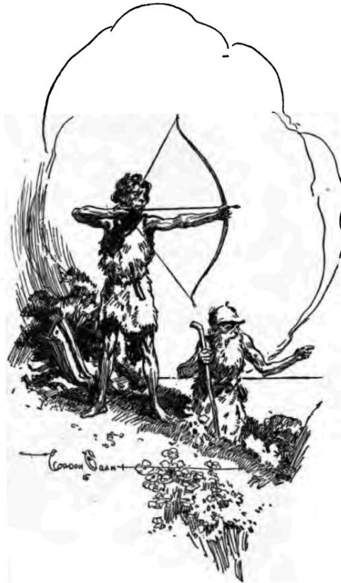
SLOWLY HE PULLED THE BOWSTRING TAUT

hand went back to the old man, touching him, and the pair stood still. Ahead, at one side of the top of the embankment, arose a crackling sound, and the boy's gaze was fixed on the tops of the agitated bushes. Then a large bear, a grizzly, crashed into view, and likewise stopped abruptly, at sight of the humans. He did not like them, and growled querulously. Slowly the boy fitted the arrow to the bow, and slowly he pulled the bowstring taut. But he never removed his eyes from the bear.