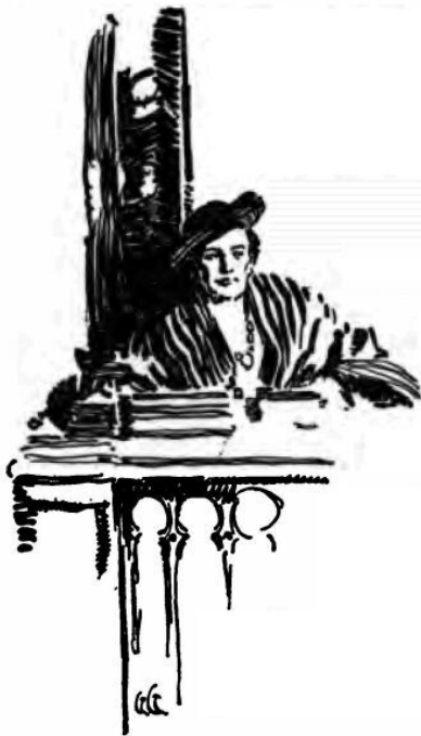
"I WAS A PROFESSOR OF ENGLISH LITERATURE."

"Our food-getters were called freemen . This was a joke. We of the ruling classes owned all the land, all the machines, everything. These food-getters were our slaves. We took almost all the food they got, and left them a little so that they might eat, and work, and get us more food—"