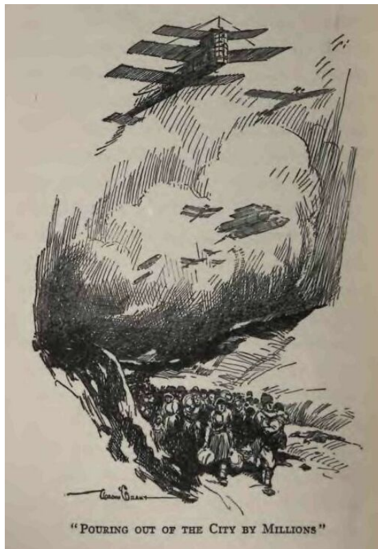
"POURING OUT OF THE CITY BY MILLIONS"

"The man who sent this news, the wireless operator, was alone with his instrument on the top of a lofty building. The people remaining in the city—he estimated them at several hundred thousand—had gone mad from fear and drink, and on all sides of him great fires were raging. He was a hero, that man who staid by his post—an obscure newspaperman, most likely.