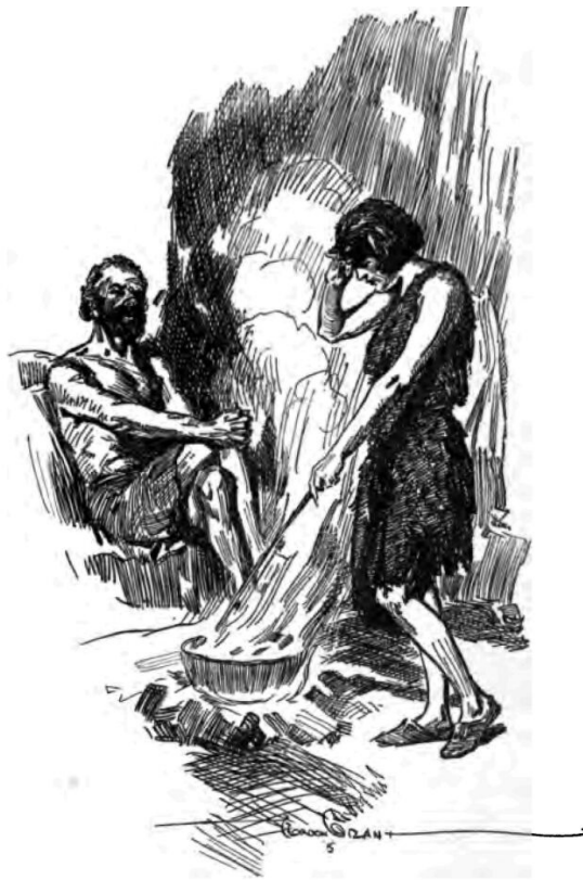
“THERE SHE WAS BOILING FISH-CHOWDER IN A SOOT-COVERED POT”

“Now the Chauffeur had been one of the servants that ran away. Returning, two months afterward, he discovered Vesta in a little summer pavilion where there had been no deaths and where she had established herself. He was a brute. She was afraid, and she ran away and hid among the trees. That night, on foot, she fled into the mountains—she, whose tender feet and delicate body had never known the bruise of stones nor the scratch of briars. He followed, and that night he caught her. He struck her. Do you understand? He beat her with those terrible fists of his and made her his slave. It was she who had to gather the firewood, build the fires, cook, and do all the degrading camp-labor—she, who had never performed a menial act in her life. These things he compelled her to do, while he, a proper savage, elected to lie around camp and look on. He did nothing, absolutely nothing, except on occasion to hunt meat or catch fish.”