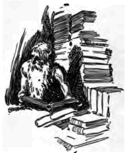
"IN THE CAVE I HAVE STORED MANY BOOKS"

"I'm going to get Granser to remember this here gunpowder stuff," Edwin said softly, "and then I'll have you all on the run. You, Hare-Lip, will do my fighting for me and get my meat for me, and you, Hoo-Hoo, will send the death-stick for me and make everybody afraid. And if I catch Hare-Lip trying to bust your head, Hoo-Hoo, I'll fix him with that same gunpowder. Granser ain't such a fool as you think, and I'm going to listen to him and some day I'll be boss over the whole bunch of you."