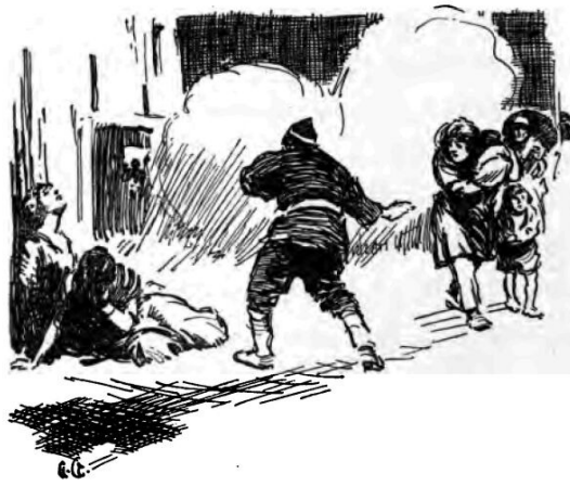
"BUT THIS NEW PLAGUE WAS QUICKER THAN THAT— MUCH QUICKER."

"From the moment of the first signs of it, a man would be dead in an hour. Some lasted for several hours. Many died within ten or fifteen minutes of the appearance of the first signs.