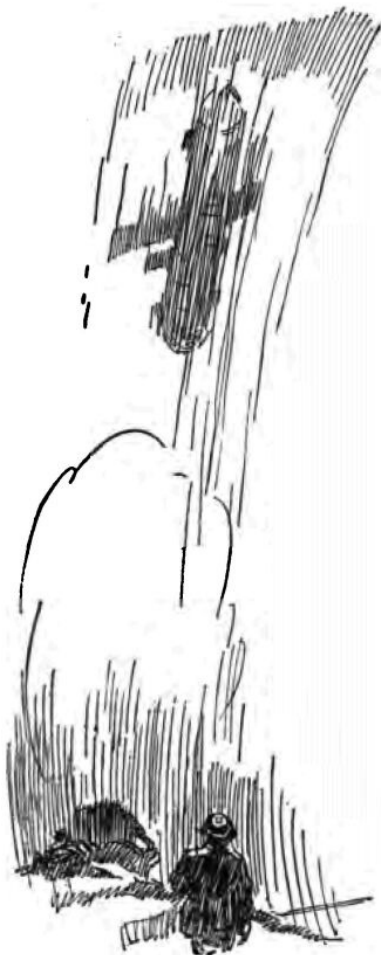
"SHE FELL LIKE A PLUMMET TO THE EARTH"

"Wearied by the unusual exercise of continual walking, that night I slept heavily. In the morning I was alone in the world. Canfield and Parsons, my last companions, were dead of the plague. Of the four hundred that sought shelter in the Chemistry Building, and of the forty-seven that began the march, I alone remained—I and the Shetland pony. Why this should be so there is no explaining. I did not catch the plague, that is all. I was immune. I was merely the one lucky man in a million—just as every survivor was one in a million, or, rather, in several millions, for the proportion was at least that."