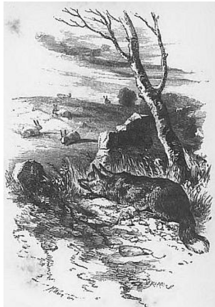
THE FOX AND THE HARES.—Page 176.

"In the meantime I watched all his plans; he then with great care and silence scraped a small hollow in the ground, throwing up the sand as a kind of screen; every now and then, however, he stopped to listen, and sometimes to take a most cautious peep into the field. When he had done this he laid himself down in a convenient posture for springing on his prey, and remained perfectly motionless, with the exception of an occasional reconnoiter of the feeding hares. When the sun began to rise, they came, one by one, from the field to the plantation; three had already come without passing by his ambush, one within twenty yards of him, but he made no movement beyond crouching still more flatly to the ground. Presently two came directly towards him, and though he did not venture to look up, I saw, by an involuntary motion of his ears, that those quick organs had already warned him of their approach. The two hares came through the gap together, and the fox, springing with the quickness of lightning, caught one and killed her immediately; he then lifted up his booty, and was carrying it off, when my rifle-ball stopped his course."