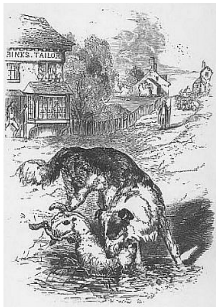
THE SHEPHERD'S DOG AND CUR.—Page 102.

As a proof of the comprehension of the shepherd's dog, I quote the description of Mr. St. John, in his "Highland Sports:"—"A shepherd once, to prove the quickness of his dog, who was lying before the fire in the house where we were talking, said to me, in the middle of a sentence concerning something else, 'I'm thinking, Sir, the cow is in the potatoes.' Though he purposely laid no stress on these words, and said them in a quiet, unconcerned tone of voice, the dog, who appeared to be asleep, immediately jumped up, and leaping through the open window, scrambled up the turf roof of the house, from which he could see the potato field. He then (not seeing the cow there) ran and looked into the byre [farm-yard], where she was, and finding that all was