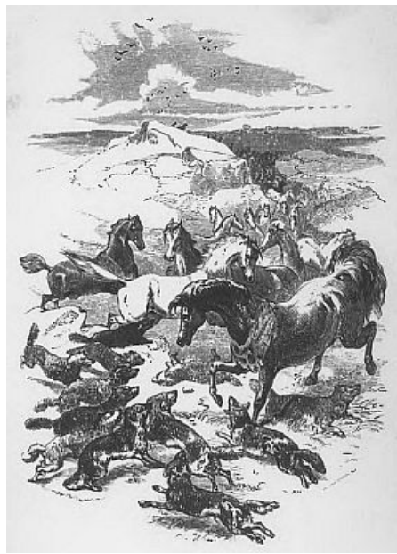
WILD HORSES AND WOLVES.—Page 330.

A friend told me the other day, that a horse had been in the habit of going with his master a certain road, and stopping at the same inn, where those who fed him always threw some beans into the corn put before him. After a time, he and his master went from that part of the country, and remained away for two years, then the same habits were resumed, and the same inn frequented; the latter, however, had changed its owners. While enjoying his dinner, the rider was informed, that his horse would not eat, that he appeared to be perfectly well, but there was something wrong about the corn, which they knew not how to rectify, for it was the very best. The gentleman went to the stable, the horse neighed, looked at him, and then at the manger, and it struck him suddenly, that the animal missed the food he had been accustomed to receive there, and no where else. "Throw some beans in," he said to the hostler; he was obeyed; and the horse looked at him as if to express his thanks, and took his meal contentedly.