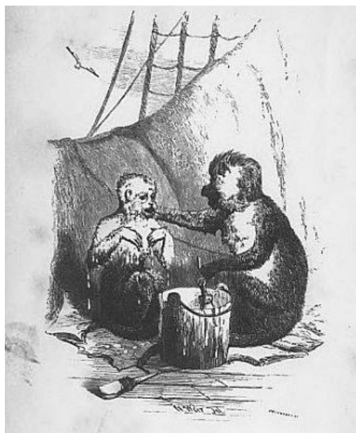
The Monkey Painter—Page 7.