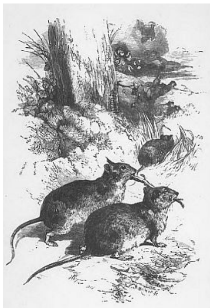
LEADING THE BLIND RAT.—Page 261.

tender feelings towards that part of creation become blunted. At the moment of which I speak, valuable books, dried plants, papers containing the data of scientific observations, concerning the survey of the river Gambia to a considerable distance, were destroyed during the illness of the observer, by rats and insects.