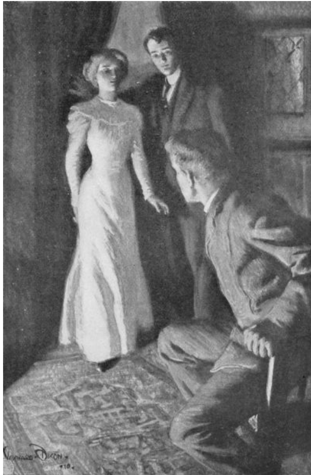
"Garry," I said, "this is—this is Berna"

His manner towards her in the early part of the interview had hurt me, had roused in me a certain perversity. I determined to stand by my guns.