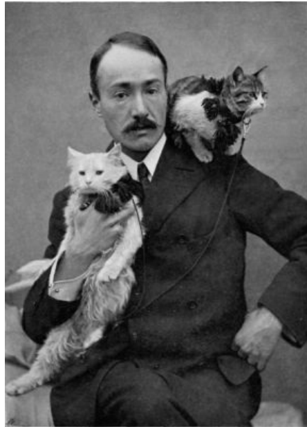
KERMAN AND ZERIS, the two Kittens who accompanied Author on his wanderings.

"A whole day was spent in preparing for the journey, and when November 4th came, shortly before midnight my provisions were packed upon my camels, with an extra load of fowls and one of fruit, while on the hump of the last camel of my caravan were perched, in a wooden box made comfortable with straw and cotton-wool, two pretty Persian kittens, aged respectively three weeks and four weeks, which I had purchased in Kerman, and which, as we shall see, lived through a great many adventures and sufferings, and actually reached London safe and sound, proving themselves to be the most wonderful and agreeable little travelling companions imaginable. One was christened "Kerman," the other "Zeris.""