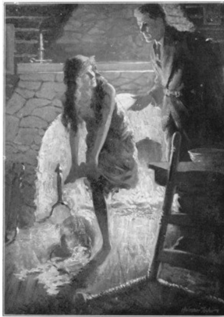
"ONE DUSTY, BUT DAINTY, FOOT WAS HELD BETWEEN HER HANDS"

was held between her hands, while she balanced on the other. A tumbling mass of rich brown curls, shot with gleaming threads like tiny rays of captive sunshine, fell, unbound, over her shoulders, and partly veiled a childlike face, tanned to an Indian brown and now twisted with pain, but nevertheless so startlingly sweet and appealing that the man gasped in astonishment.