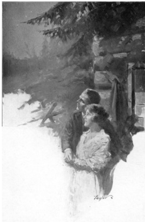
"A MAN AND A WOMAN—AS IT WAS IN THE BEGINNING" (See Page 374)

THE PAGE COMPANY 53 BEACON STREET, BOSTON