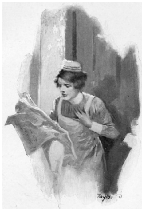
"READ THE BRIEF ARTICLE TWICE, MECHANICALLY, AND ALMOST WITHOUT UNDERSTANDING"

The call came for the morning prayer, and she handed the paper back without a word; but for once the simple exercises, which, on this morning, should have meant so much more than usual, wholly failed to bring their customary peace. Her lips formed the words of the prayer, and joined in the singing of the hymn, but her mind was far away in France, and her heart rebellious within her. 299