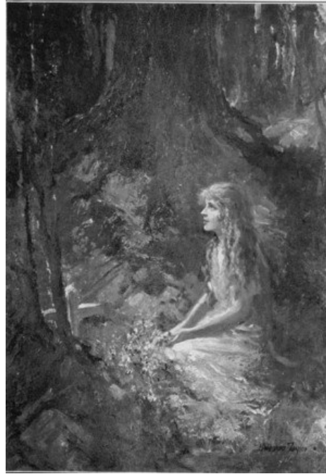
"SHE WAS KNEELING BESIDE A LOW, ROUNDED MOUND"

Donald waited in silence, leaning against a concealing tree trunk, until the child had ended her act of simple devotion by throwing an unaffected kiss from her finger tips, not towards the dead earth, but upwards to the spirit world above.