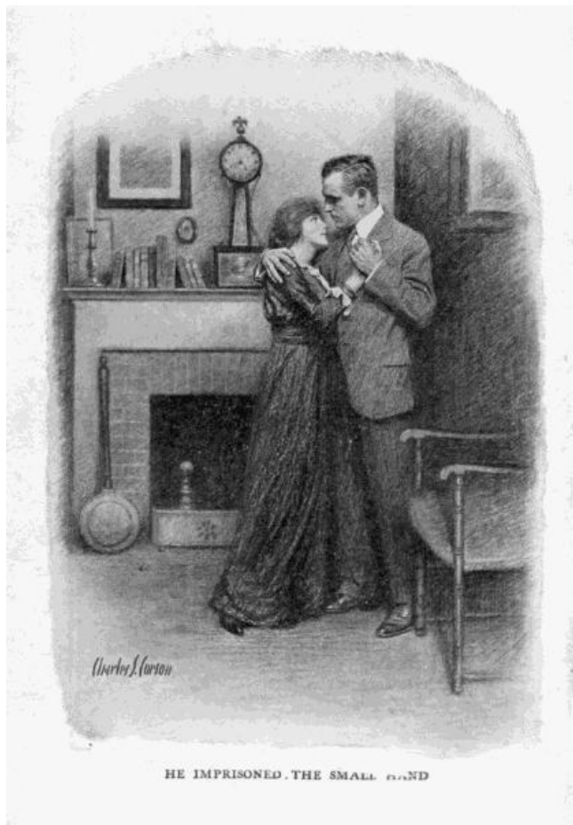
HE IMPRISONED THE SMALL BAND