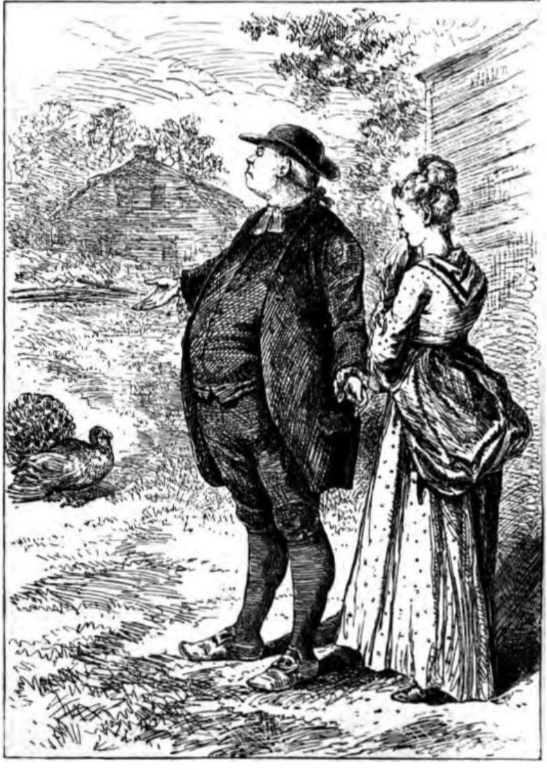
" Huldy came behind, jist chokin' with laugh." - Page 65.

"Huldy came behind jist chokin' with laugh, and afraid the minister would look 'round and see her.