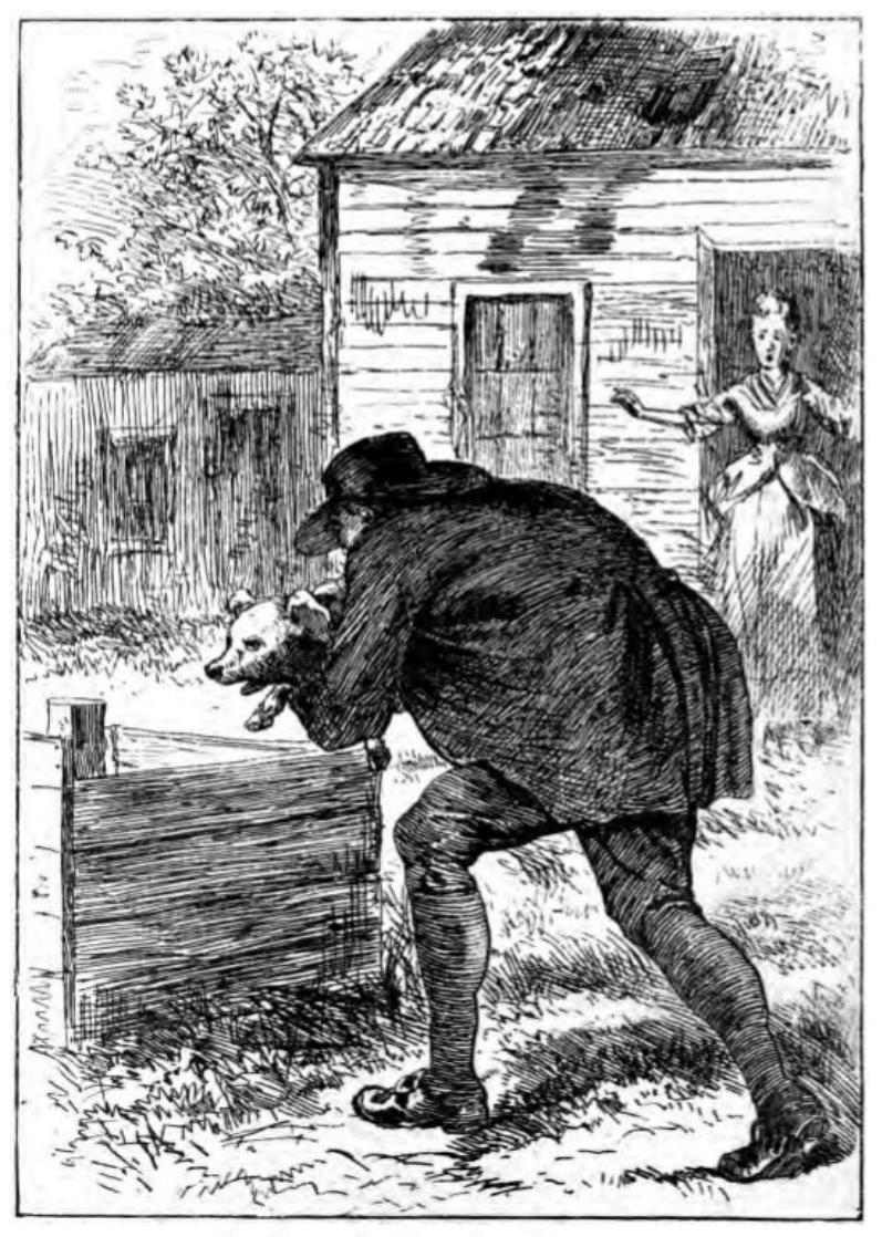
" I've thrown the pig in the well." - Page 70.

"'Lordy massy!' says the parson: 'then I've thrown the pig in the well!'