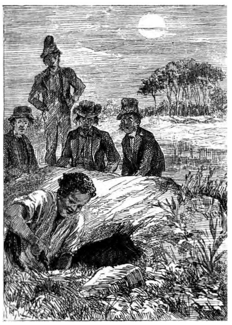
" They dug down about five feet." - Page 119.

"Wal, then Hokum and Toddy Whitney was into the hole in a minute: they made Primus get out, and they took the spade, 'cause they wanted to be sure to come on it themselves.