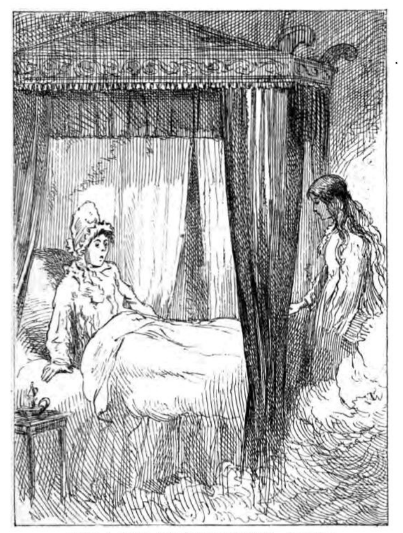
" She stood there, lookin' right at Cinthy." - Page 149.

"Wal, takin' the flip so right the last thing afore goin' to bed, she went right off to sleep as sound as a nut, and slep' on till somewhere about mornin', when she said somethin' waked her broad awake in a minute. Her eyes flew wide open like a spring, and the storm hed gone down and the moon come out; and there, standin' right in the moonlight by her bed, was a woman jest as white as a sheet, with black hair hangin' down to her waist, and the brightest, mourn fullest black eyes you ever see. She stood there lookin' right at Cinthy; and Cinthy thinks that was what waked her up; 'cause, you know, ef anybody stands and looks steady at folks asleep it's apt to wake 'em.