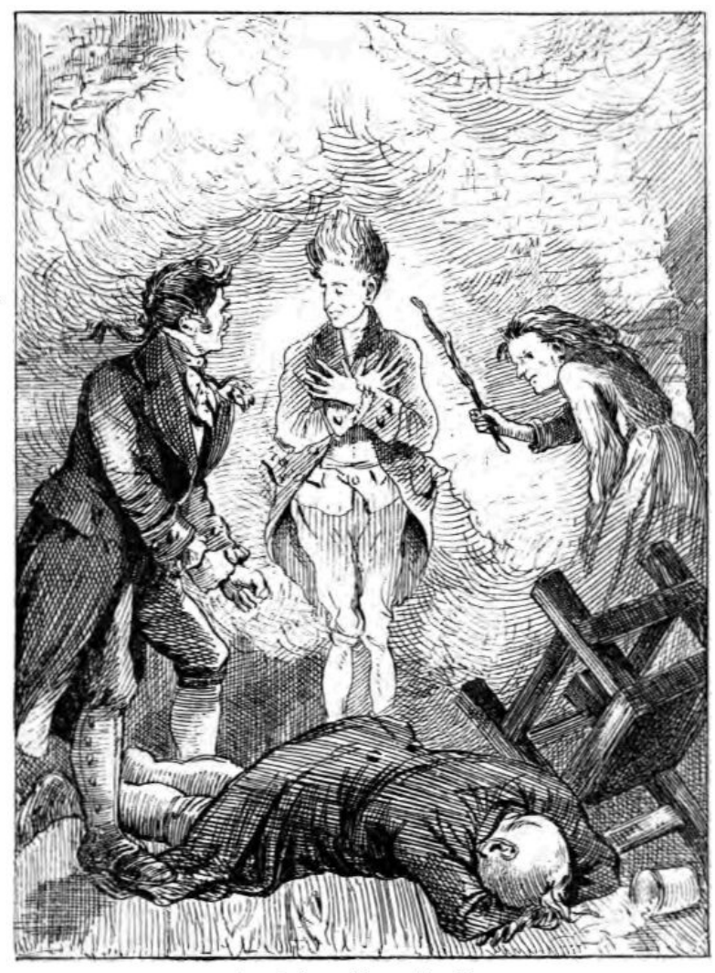
" Old Cack knew him too." - Page 20.

"Old Cack knew him too; and he fell flat on his face, and prayed the Lord to have mercy on his soul: but Cap'n Eb he was for gettin' to the bottom of matters, and not have his scare for nothin'; so he says to him, 'What do you want, now you hev come?'