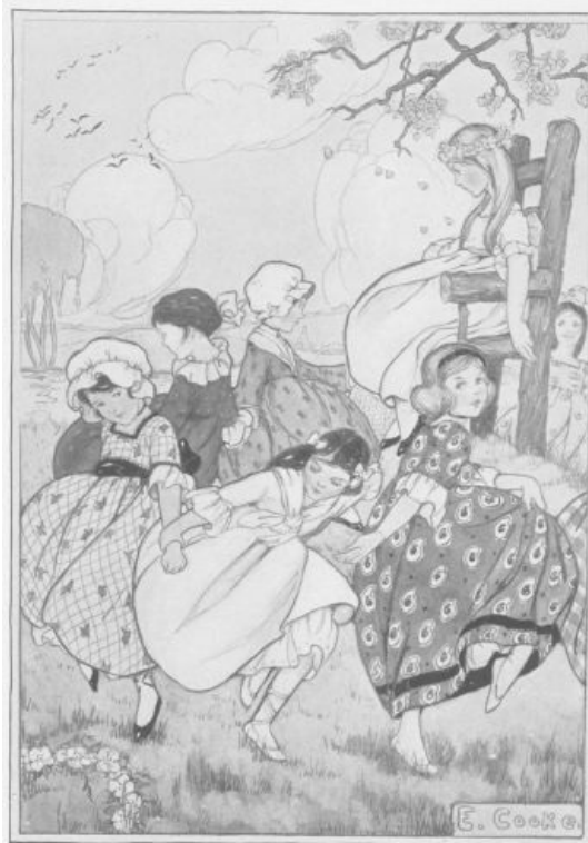
"THE FIRST OF MAY IS GARLAND DAY"

"The First of May is garland day, And every child should dance and play. Curl your locks as I do mine, And wear your summer gown so fine."