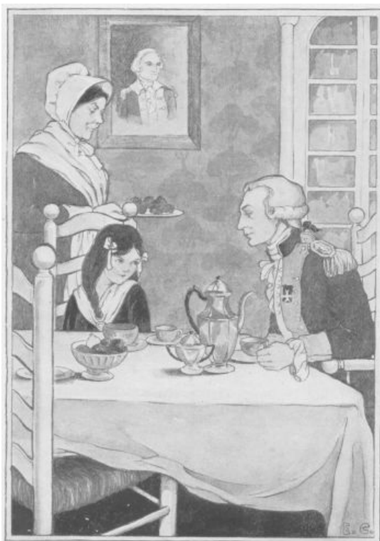
SHE LOOKED UP TO FIND LAFAYETTE SMILING AT HER