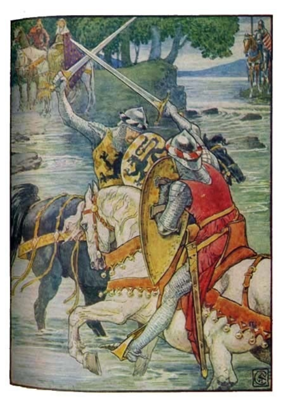
BEAUMAINS WINS THE FIGHT AT THE FORD

Beaumains answered naught, and so they went on their way.