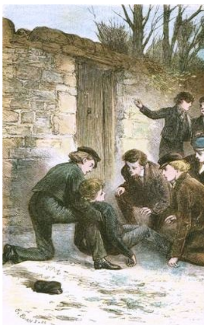
THE CROFTON BOYS.