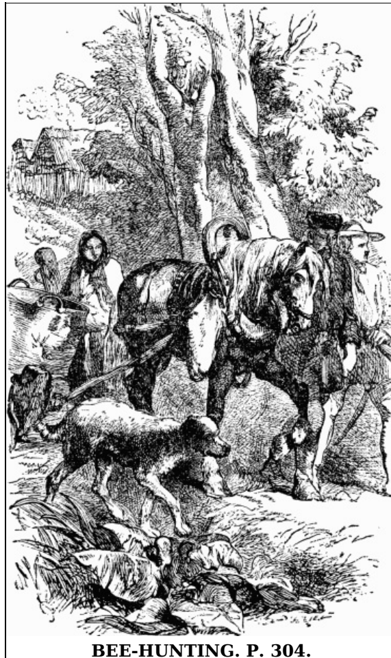
BEE-HUNTING. P. 304.