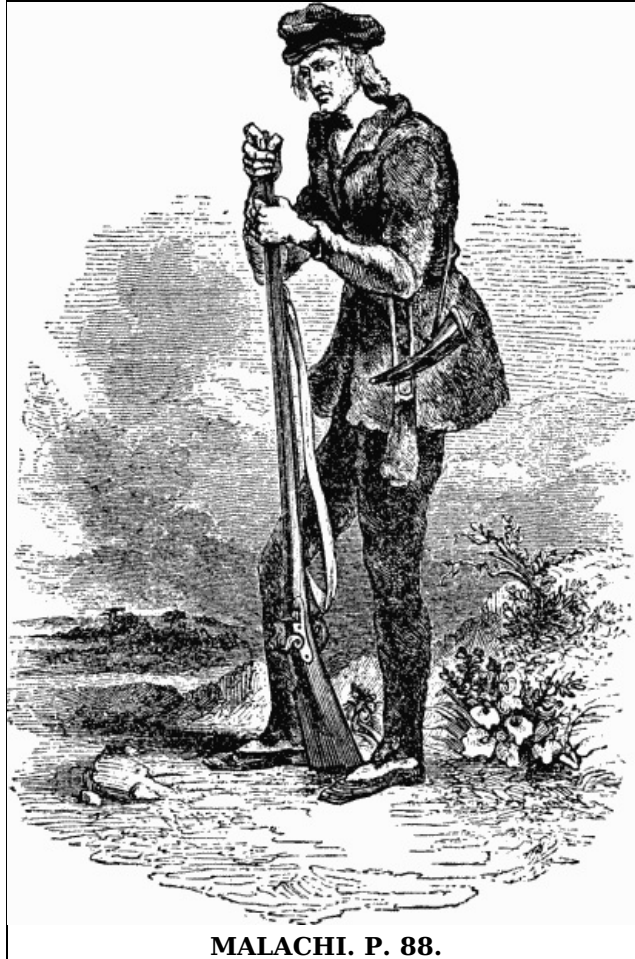
MALACHI. P. 88.

"Disturbance!—why we don't make a great deal of noise; no, it's no frolic; we are come to settle here, and shall be your neighbors."