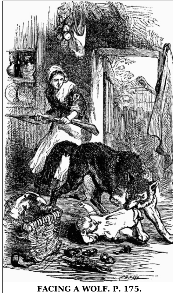
FACING A WOLF. P. 175.

"And who was that, Martin?" said Mrs. Campbell.