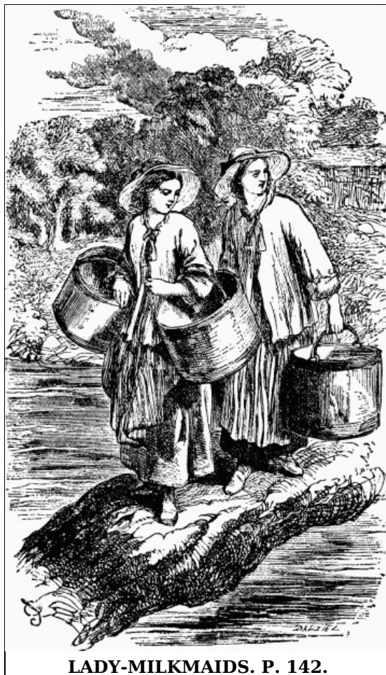
LADY-MILKMAIDS. P. 142.