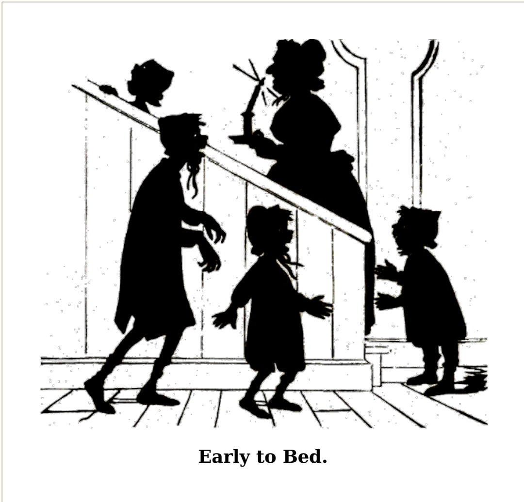
Early to Bed.

It happened one day, as Bo-peep did stray Into a meadow hard by, There she espied their tails side by side. All hung on a tree to dry.