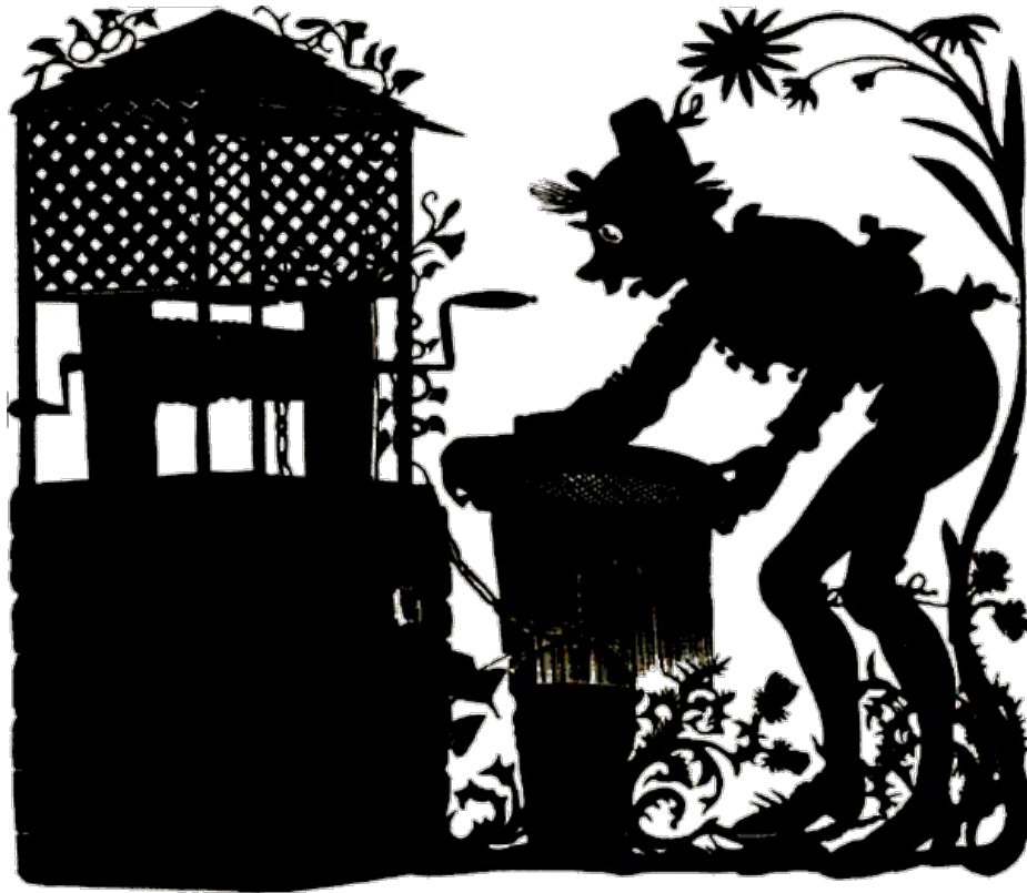
Simon Drawing Water.

He went for water in a sieve But soon it all run through; And now poor Simple Simon Bids you all adieu!