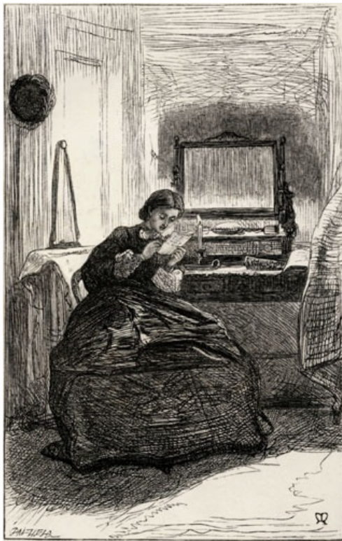
The Angel of Light.