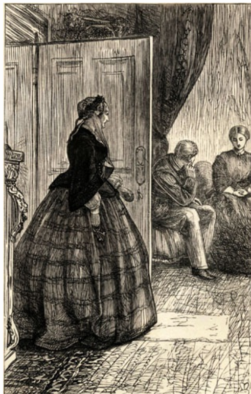
Lady Staveley interrupting her Son and Sophia Furnival.

The lesson might perhaps have been given, and Miss Furnival might have imparted to Mr. Staveley her idea of "excelsior" in the matter of love-making, had not Mr. Staveley's mother come into the room at that moment. Mrs. Staveley was beginning to fear that the results of her Christmas hospitality would not be satisfactory. Peregrine Orme, whom she would have been so happy to welcome to the warmest corner of her household temple as a son, had been sent away in wretchedness and disappointment. Madeline was moping about the house, hardly making an effort to look like herself; attributing, in her mother's ears, all her complaint to that unexpected interview with Peregrine Orme, but not so attributing it—as her mother fancied—with correctness. And there was Felix Graham still in the room up stairs, the doctor having said that he might be moved in a day or two;—that is, such movement might possibly be effected without detriment;—but having said also that another ten days of uninterrupted rest would be very desirable. And now, in addition to this, her son Augustus was to be found on every wet morning closeted somewhere with Sophia Furnival;—on every wet morning, and sometimes on dry mornings also!