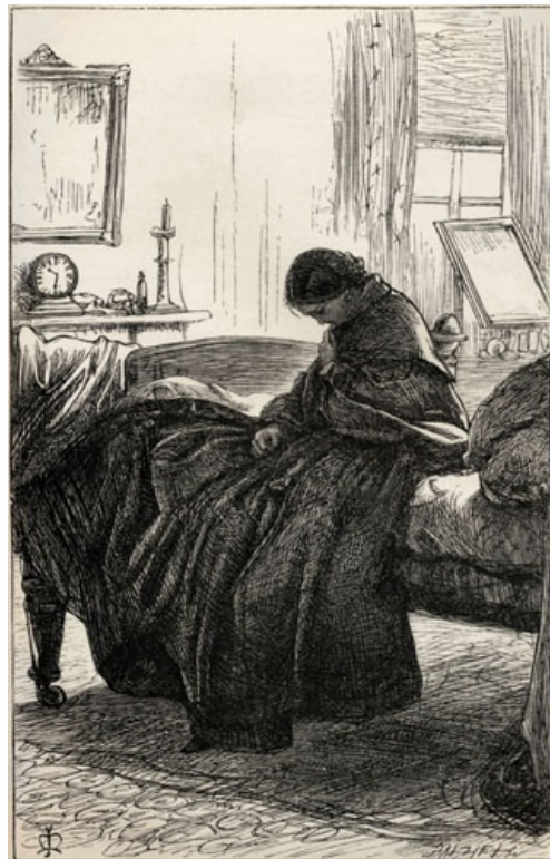
Lady Mason after her Confession.

Slowly and very silently she made her way up to her own room, and having closed the door behind her sat herself down upon the bed. It was as yet early in the morning, and the servant had not been in the chamber. There was no fire there although it was still mid-winter. Of such details as these Sir Peregrine had remembered nothing when he recommended her to go to her own room. Nor did she think of them at first as she placed herself on the bed-side. But soon the bitter air pierced her through and through, and she shivered with the cold as she sat there. After a while she got herself a shawl, wrapped it close around her, and then sat down again. She bethought herself that she might have to remain in this way for hours, so she rose again and locked the door. It would add greatly to her immediate misery if the servants were to come while she was there, and see her in her wretchedness. Presently the girls did come, and being unable to obtain entrance were told by Lady Mason that she wanted the chamber for the present. Whereupon they offered to light the fire, but she declared that she was not cold. Her teeth were shaking in her head, but any suffering was better than the suffering of being seen.