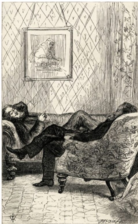
Mr. Chaffanbrass and Mr. Solomon Aram.