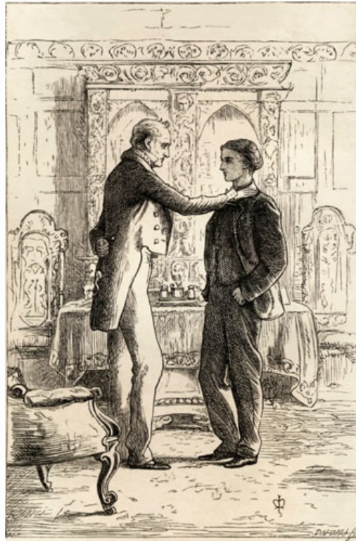
Sir Peregrine and his heir.

"But I shall be glad, sir, if you will favour me with your intentions," said Sir Peregrine, with severity. "A gentleman does not, I presume, send his orders to a tradesman without having some intention of paying him for his goods."