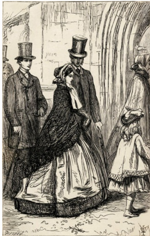
Christmas at Noningsby—Morning.

"We shall be going home then and it will not signify. Remember, Mr. Graham, I shall expect you to come forward in great strength for blindman's buff." As he gave her the required promise, he thought that even the sports of Christmas-day would be bearable, if she also were to make one of the sportsmen; and then they entered the church.