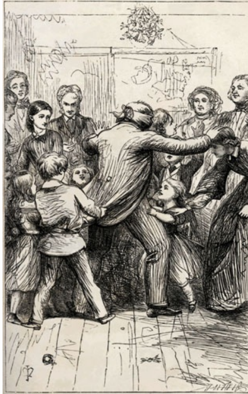
Christmas at Noningsby—Evening.

"Justice is blind," said Graham. "Why should a judge be ashamed to follow the example of his own goddess?" And so at last the owner of the ermine submitted, and the stern magistrate of the bench was led round with the due incantation of the spirits, and dismissed into chaos to seek for a new victim.