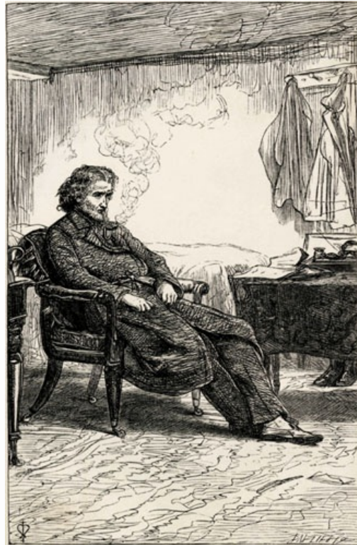
Von Bauhr's Dream.

It was a grand thought; and though there was in it much of human conceit, there was in it also much of human philanthropy. If a reign of justice could be restored through his efforts—through those efforts in which on this hallowed day he had been enabled to make so great a progress—how beautiful would it be! And then as he sat there, while the smoke still curled from his unconscious nostrils, he felt that he loved all Germans, all Englishmen, even all Frenchmen, in his very heart of hearts, and especially those who had travelled wearily to this English town that they might listen to the results of his wisdom. He said to himself, and said truly, that he loved the world, and that he would willingly spend himself in these great endeavours for the amelioration of its laws and the perfection of its judicial proceedings. And then he betook himself to bed in a frame of mind that was not unenviable.