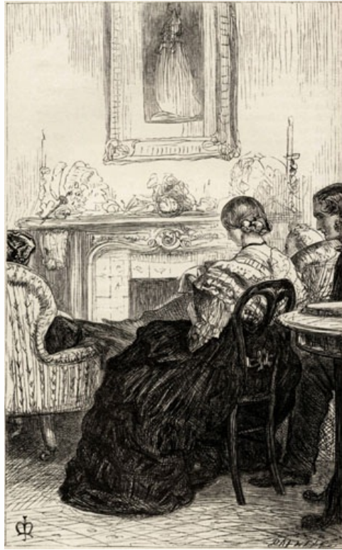
The Drawing-Room at Noningsby.

Graham had before been at Noningsby, she would have rebelled against nature with all her force rather than have slept while he was left to whisper what he would to her darling. But now he was authorised to whisper, and why should not Lady Staveley sleep if she wished it? She did sleep, and Felix was left alone with his love.