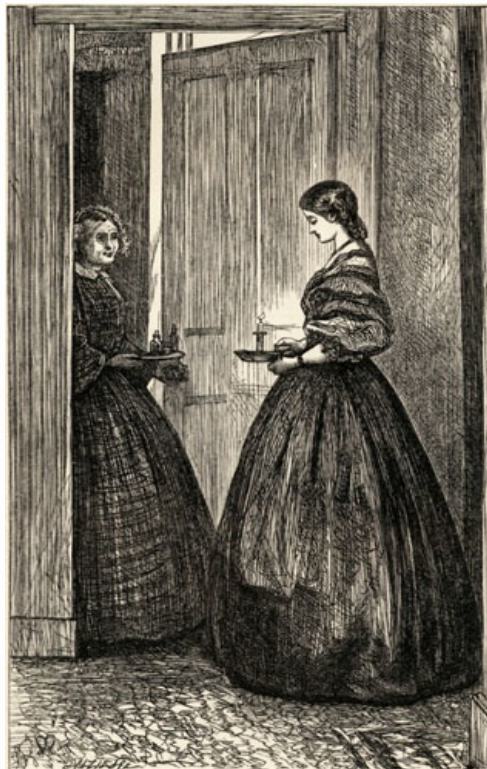
Footsteps in the corridor.

Mrs. Baker was in the doorway as Madeline attempted to pass by on tiptoe. "Oh, he's a deal better now, Miss Madeline, so that you needn't be afraid of disturbing;—ain't you, Mr. Graham?" So she was thus brought into absolute contact with her friend, for the first time since he had hurt himself.