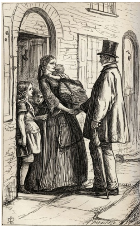
John Kenneby and Miriam Dockwrath.