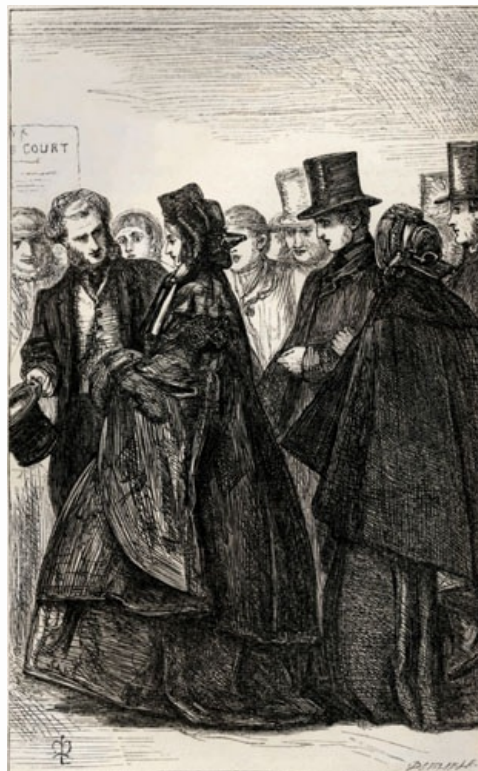
Lady Mason leaving the Court.

"The carriage is there now," said Mr. Aram, who had left the court for a minute; "and I think you may get into it quietly." This accordingly they did, making their way through an avenue of idlers who still remained that they might look upon the lady who was accused of having forged her husband's will.