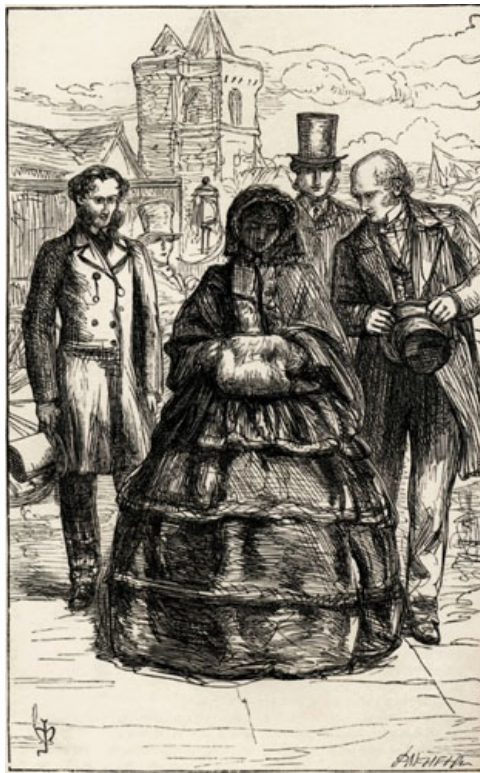
Lady Mason going before the Magistrates.