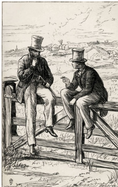
The English Von Bauhr and his pupil.

The two men had got away from the thickness of the Birmingham smoke, and were seated on the top rung of a gate leading into a stubble field. So far they had gone with mutual consent, but further than this Staveley refused to go. He was seated with a cigar in his mouth. Graham also was smoking, but he was accommodated with a short pipe.