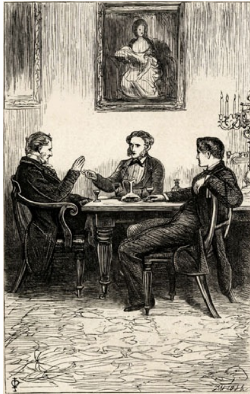
Over their Wine.

"But I should be wicked beyond everything if I were to complain, seeing that Providence has given me so much that I had no right to expect. What should I have done in my loneliness if Sir Peregrine's hand and door had never been opened to me?" And then for the next half-hour the two ladies held sweet converse together, during which we will go back to the gentlemen over their wine.