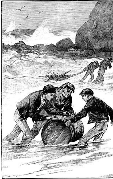
THEY SUCCEEDED IN ROLLING IT UPON THE BEACH. Figure 136.

An object in the surf now caught their sight, some way ahead, at a spot free from rocks. Hastening forward they found that it was a cask, and after several efforts, at the risk of being carried off by the sea, they succeeded in rolling