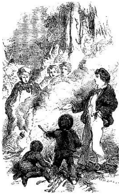
The Island Breakfast.—I., 156.

“Good morning!” cried Max; “you see we have breakfast nearly ready; and a breakfast, too, that will be a positive luxury, after so long a course of cocoa-nut diet; how Browne will exult at the sight of it; how his eyes will open—to say nothing of his mouth! And don’t we deserve a vote of thanks for our early labours for the general good?”