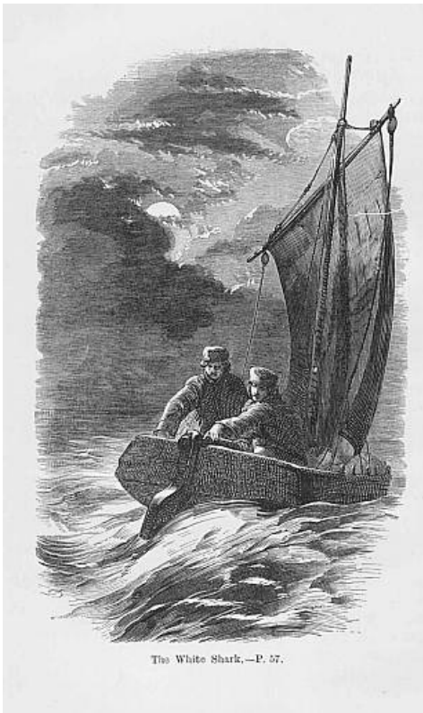
The White Shark.—P. 57.

even knew when he shifted his position in the stern, from one side to the other. At length I must have fallen into a deep sleep: I do not know how long it had lasted, (it seemed to me but a short time), when I was aroused by an exclamation, from Max, as I at first supposed; but on sitting up I saw that Browne was at the helm, while Max was sleeping at my side. On perceiving that I was awake, Browne, from whom the exclamation had proceeded, pointed to something in the water, just astern. Following the direction of his finger with my eye, I saw, just beneath the surface, a large ghastly-looking white shark, gliding stealthily along, and apparently following the boat. Browne said that he had first noticed it about half an hour before, since which time it had steadily followed us, occasionally making a leisurely circuit round the boat, and then dropping astern again. A moment ago, having fallen into a doze at the helm, and awaking with a start, he found himself leaning over the gunwale, and the shark just at his elbow. This had startled him, and caused the sudden exclamation by which I had been aroused. I shuddered at his narrow escape, and I acknowledge that the sight of this hideous and formidable creature, stealing along in our wake, and manifesting an intention to keep us company, caused me some uneasy sensations. He swam with his dorsal fin almost at the surface, and his broad nose scarcely three feet from the rudder. His colour rendered him distinctly visible.