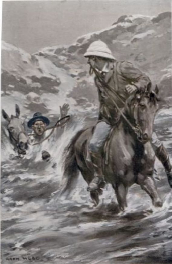
"HE WHEELED IN THE SADDLE IN THE NICK OF TIME TO SEE LING'S MULE SINK BACK INTO THE SWIRLING TORRENT"

"Well," said Frobisher determinedly, "if this is the only place, this is where we cross. The river is rising very