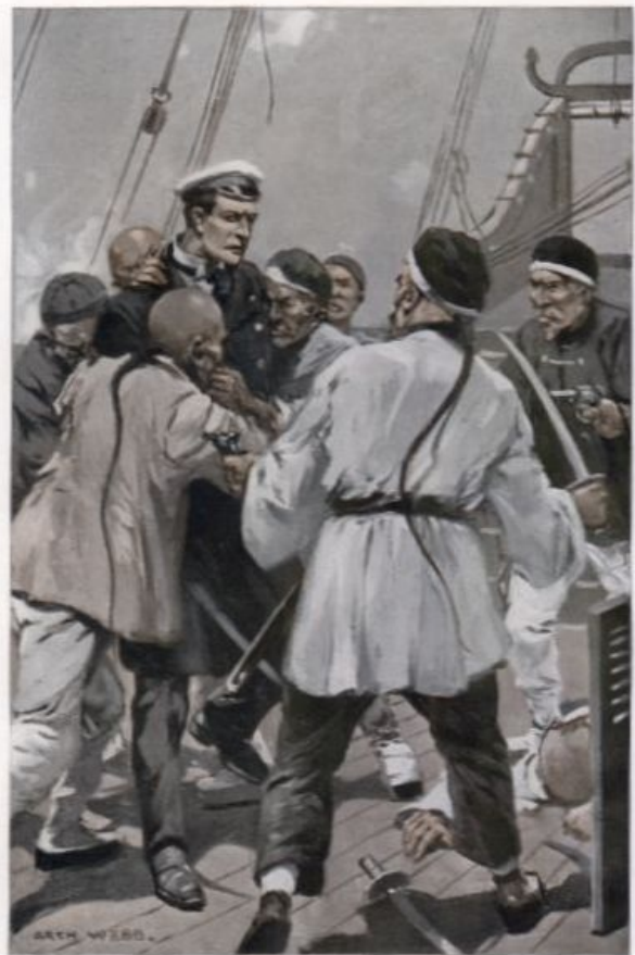
"FROBISHER SUDDENLY FELT HIMSELF SEIZED ROUND THE NECK AND BODY BY HALF A-DOZEN PAIRS OF ARMS"