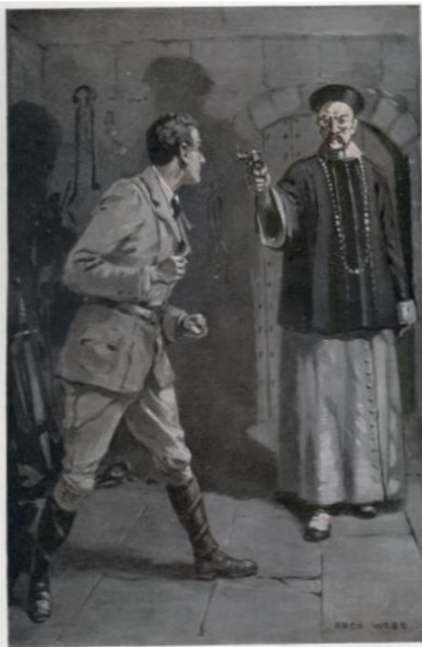
“ONE STEP FARTHER AND I SHOOT TO WOUND—PAINFULLY”

out of the corner of his eye as he turned, for he was round again in a moment, and, dodging the Englishman's furious leap, thrust a hand inside his jacket, and before Frobisher could get to grips with him, he found himself confronted with the muzzle of a heavy revolver, pointing straight at him, the Governor's forefinger already crooked round and pressing the trigger.