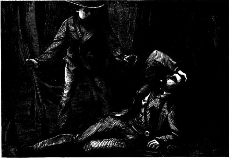
A Photograph in the Forest.

Before he can bring his gun to bear upon it, the animal is out of sight; having passed behind the thick standing trunks of the cypresses. He restrains his hound, about to spring off on the spot. The stag has not seen him; and, apparently, going unscared, he hopes to stalk, and again get sight of it.