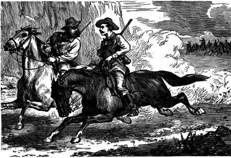
To all appearance they are riding in hot haste.