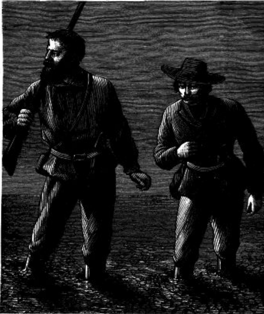
On the Track.

Before they can spring into their saddles, the deer-hound darts off from their midst—as he does so giving out a growl.