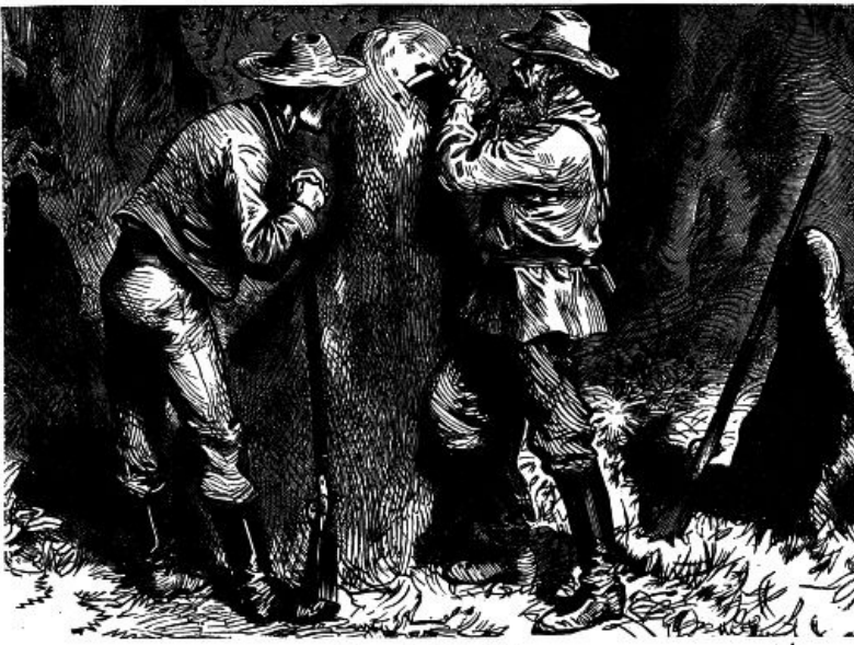
They extracted the ball.