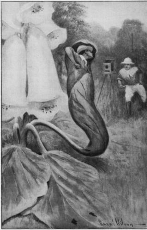
THE HUGE LEAF SUDDENLY CURLED UP. (p. 111)

the brute can have been.” (He was referring to the strange beast which Dick had shot). “Do you think you could draw a picture of him?”