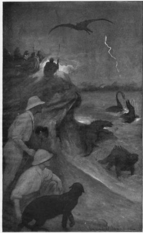
HE SAW ENOUGH TO FULLY CONFIRM HIS PREVIOUS CONVICTION. (p. 143)

rapidly became wilder and more picturesque as they went, to such an extent indeed that Dick quickly made up his mind to pay it another and more leisurely visit; and after about an hour's tramp, which carried him into a labyrinth of rocks, he got a splendid shot at a creature strongly resembling a bighorn, which he neatly bowled over and with it triumphantly returned to camp.