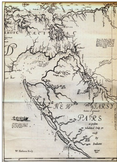
THE NORTHEAST PORTION OF AUGUSTINE HERRMAN'S MAP OF MARYLAND, 1673