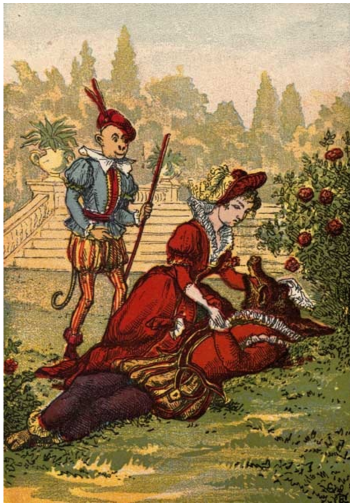
The Beast Dying.

She then ran to a fountain for cold water, which she sprinkled over him, her tears meanwhile falling fast upon his hideous face. In a few moments the Beast opened his eyes, and said, "now, that I see you once more, I shall die contented." "No, no,!" she cried, "you shall not die; you shall live, and Beauty will be your faithful wife!" The moment she uttered these words, a dazzling light shone around—the palace was brilliantly lighted up, and the air was filled with delicious music.