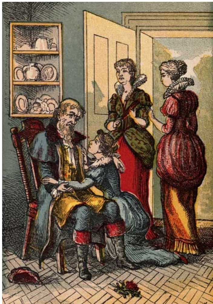
Beauty takes her Fathers place.

Lying on the table was a portrait of herself, set in gold and diamonds, and on the wall, these words: " Beauty is Queen here; all things will obey her. " Her meals were served to the sound of music; and at supper-time, the Beast after knocking timidly, would walk in and talk so amiably, that she soon lost all fear of him; and once when he failed to come, felt quite disappointed! At last, one night, he said to her, "Am I so very ugly?" "Yes, indeed, you are," said Beauty, "but you are so kind and generous, that I do not mind your looks." "Will you marry me, then, dear Beauty?" said the poor Beast, with a look of such eager entreaty in his eyes, that Beauty's heart melted within her, and she was upon the point of saying "Yes!"