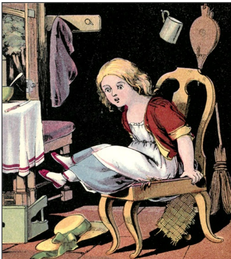
GOLDENHAIR BREAKS THE BOTTOM OUT OF TINY-

Then she tried Tiny-Cub's bowl, and said, "This is nice; I will put in some salt, and of bread a thick slice."