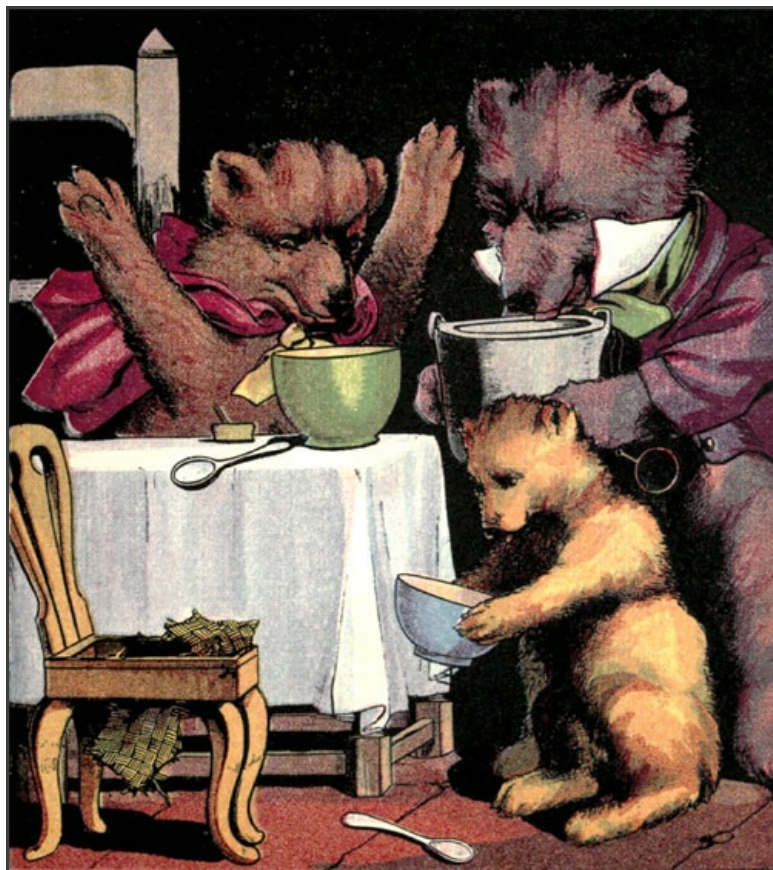
THE BEARS COME HOME AND FIND THEIR PORRIDGE ALL GONE.

Said Big Bruin, "I'm hungry—to eat, let's begin— WHO HAS BEEN TO MY PORRIDGE?" he roared with such might;