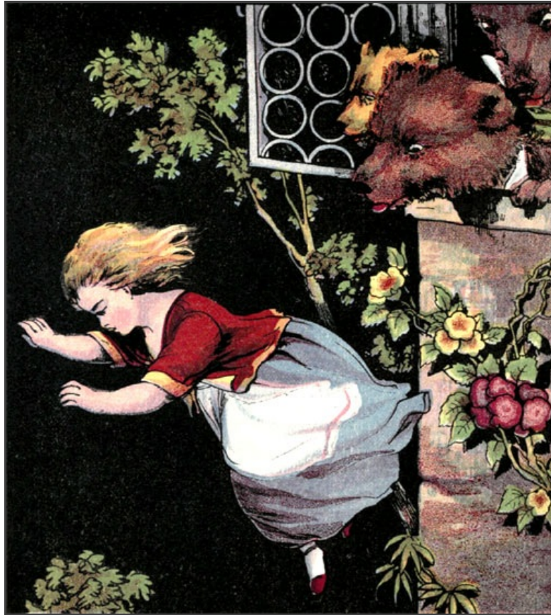
GOLDENHAIR JUMPS OUT OF THE WINDOW.

And if I can help it, she shall not escape.”