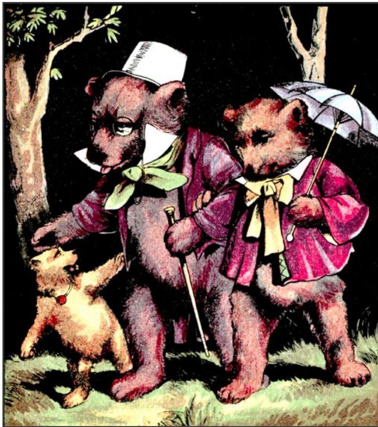
THE BEAR, WITH HIS WIFE AND SON, TAKES A WALK.

Said she to herself, "To rob bears is no sin; The three bears have gone out, so I think I'll go in."