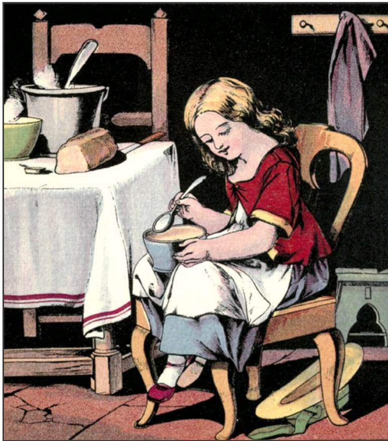
GOLDENHAIR EATS UP TINY-CUB'S PORRIDGE.

Then she tried Tiny-Cub's bowl, and said, "This is nice; I will put in some salt, and of bread a thick slice."