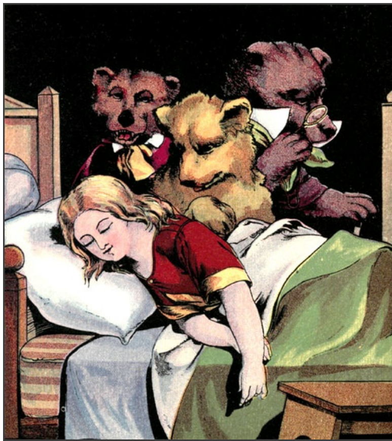
THE BEARS FIND GOLDENHAIR ASLEEP IN TINY-CUB'S BED.

"WHO HAS BEEN UPON MY BED?" old Bruin roared out, In a voice just like rain down a large water-spout.