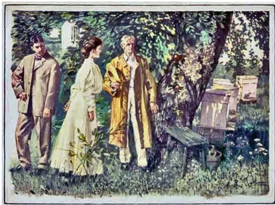
"Mr. Trowbridge took me to the beehives to get some honey and show me what a queen bee is like"

He explained everything to us, or rather to me, for Mr. Brett knew all about it beforehand. Then we had a long walk over the hills, which are billowy and wooded, like Surrey, and when we came back Mr. Trowbridge took me to the beehives to get some honey and show me what a queen bee is like. He gave me a hat with a mosquito-net veil and put on one himself. Then he opened a hive, and when I wasn't a bit nervous, because I trusted him, he said, "I tell you what it is, Lady Betty, you're a trump. I shouldn't be surprised if there isn't something in blood after all."