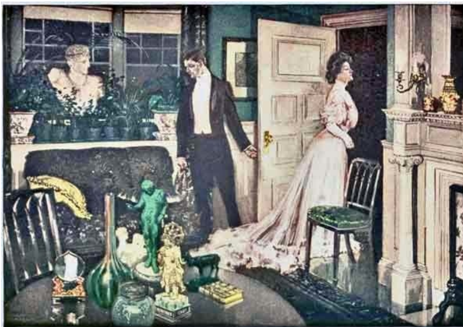
"I swept past him with my nose in the air, trying to look like Mother"

"If you don't, I'll scream at the top of my lungs," I said. And he must have seen that I meant it, for he flung open the door with a slam and I swept past him, with my nose in the air, trying to look like Mother.