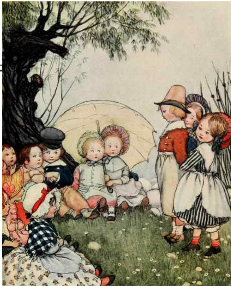
The court was held on the grass by the pond.

The court was held on the grass by the pond. I recognised in a certain Admiral among my judges my deadliest foe. A cocoa-nut had given rise to language that I could not brook. But confiding in my innocence, and also in the knowledge that the President of the United States (who sat next him) owed me a knife, I braced myself for the ordeal.