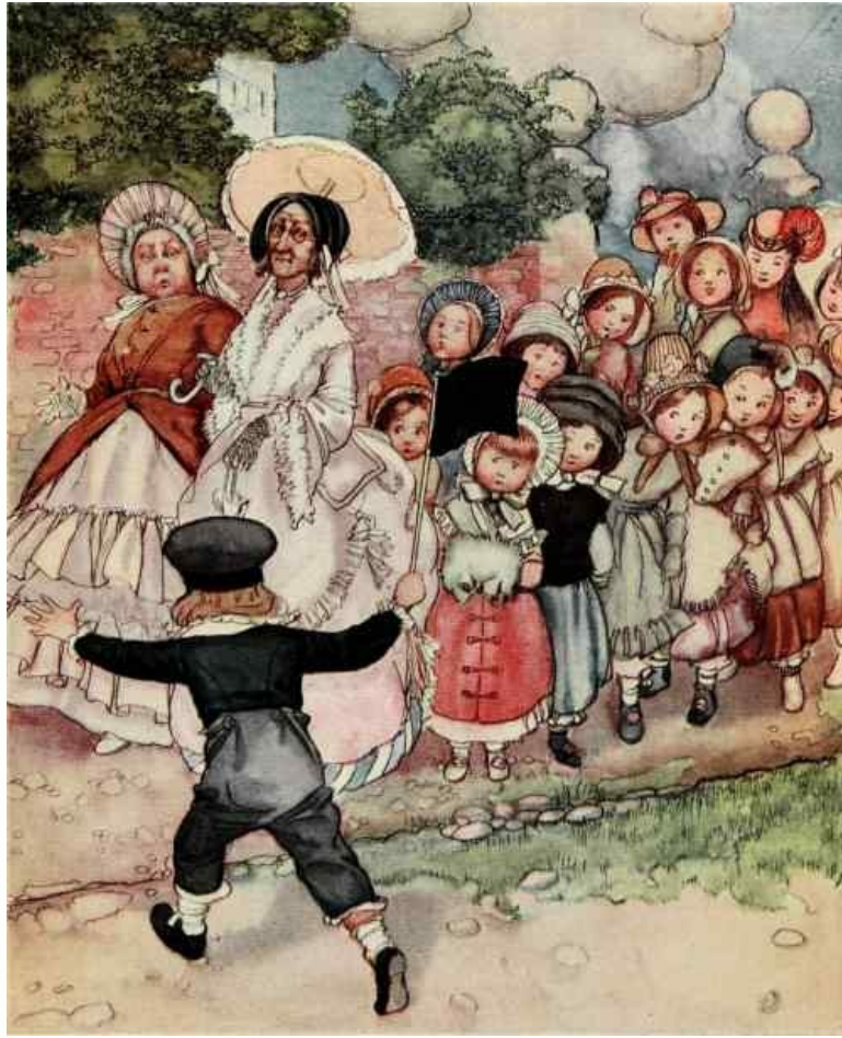
Waving his black flag, the Colonel attacked.

The enemy appeared—approached. Waving his black flag, the Colonel attacked. Confusion ensued. Anxiously I awaited my signal, but my signal came not. So far from falling, the hated Drowvey in spectacles appeared to me to have muffled the Colonel's head in his outlawed banner, and to be pitching into him with a parasol. The one in the lavender bonnet also performed prodigies of valour with her fists on his back. Seeing that all was for the moment lost, I fought my desperate way hand to hand to the lane. Through taking the back road, I was so fortunate as to meet nobody, and arrived there uninterrupted.