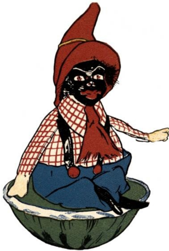
Little Yam Mango.