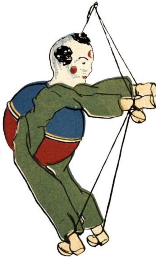
The Swinging Clown.