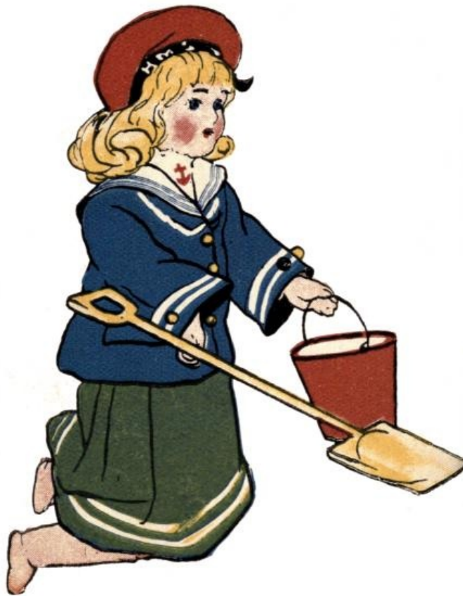
The Sea-side Doll.