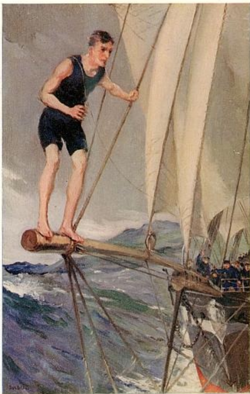
"THE SINKINGS AND SOARINGS OF THAT BOOM-END MADE ME FEEL DISTINCTLY GIDDY."

"Yes," answered the mate, "everything is quite ready. I've left about five fathoms of bare end for bending on; and I think you can't do much better than take a turn with it round the mizenmast, under the spider-band."