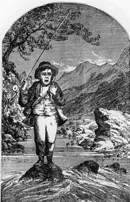
"The rock on which he stood was too narrow to admit of much movement."

Mr Sudberry, in despair, made a desperate grasp at this and caught it. More than that—it caught him, and sunk into his forefinger over the barb, so that he could not get it out. The rock on which he stood was too narrow to admit of much movement, much less to permit of his resting the butt of his rod on it, even if that had been practicable—which it was not, owing to the line being fast to the bough, and the reel in a state of dead-lock from