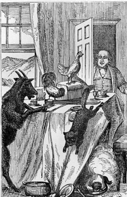
"He was struck absolutely dumb by the amazing 'tableau vivant' that met his vision."

There was nothing in the aspect of the room itself to surprise him. It was homely and neat. The table was spread with a clean white cloth, on which the breakfast equipage was displayed with a degree of care and precision that betrayed the master-hand of Hobbs; but on the edge of the table sat a large black cat, calmly breakfasting off a pat of delicious fresh butter. Beside the table, with its fore-legs thereon and its hind-legs on the floor, stood a large nanny-goat, which was either looking in vain for something suited to its own particular taste, or admiring with disinterested complacency the energy with which two hens and a bantam cock pecked out the crumb of a