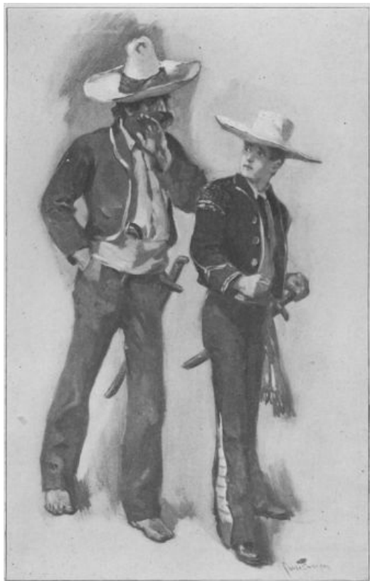
"WE HAVE ORDERS TO TAKE CARE OF YOU"

"Say nothing, Señor Carfora. Walk on into the consulate. I belong to General Zuroaga. There are four more of his men here. We have orders to take care of you. You are the young Englishman that brought us the powder. There was not a pound to be bought in Vera Cruz, but some of those fellows would knife you for a gringo."