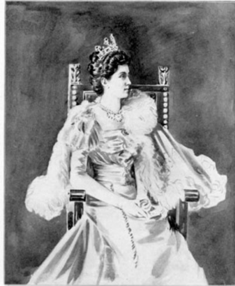
QUEEN HELENA OF ITALY

The wise woman does not take her exercise in the afternoon, but in the morning, an hour or so after breakfast, when the day is young and everything seems bright and hopeful and cheery. Then it is that the babies are out in their go-carts and carriages, and the "chillens" are trooping to school. It's heaps pleasanter than an afternoon walk when one has more of the worries and events of the day on one's mind.