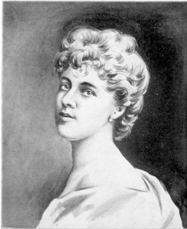
PRINCESS HENRY OF PLESS

If one seriously desires fine, beautiful, white teeth—and who doesn't?—one must treat them well. Just before going to bed, give them a thorough cleaning, using waxed dental floss to remove any large particles which may be between them. Use only a pure powder, the ingredients of which you know. Be sure that all powder is well rinsed away. See that your brush is kept scrupulously clean. Upon arising in the morning rinse the mouth with diluted listerine. This makes an excellent wash, especially when the gums are tender and liable to bleed. Brush the teeth with tepid water. After breakfast, luncheon and dinner, wash them again, letting the last cleansing be the most searching and thorough. Once in a while it is wisdom to squeeze a little lemon juice onto the brush. This will remove the yellow appearance that often comes, and will also keep your teeth free from tartar.