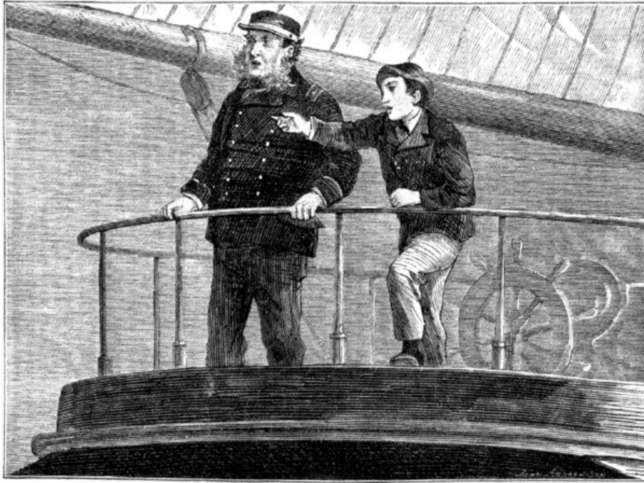
Captain Bounce cannot see the Town. Page 218.

watched the progress of the yacht. Doubtless he felt belittled at finding himself placed under the orders of a mere boy, even though the pilot was as polite as a French dancing-master.