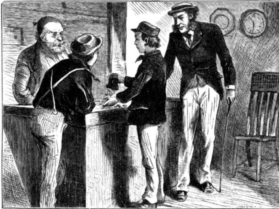
Stumpy pouring out the Gold. Page 302.

"You bet!" added Stumpy. "I've been thinking all the time about getting my mother out of trouble, and only just now it comes into my head that Le's father is in hot water. I'll tell you what we'll do, Le: I'll give you five hundred—"