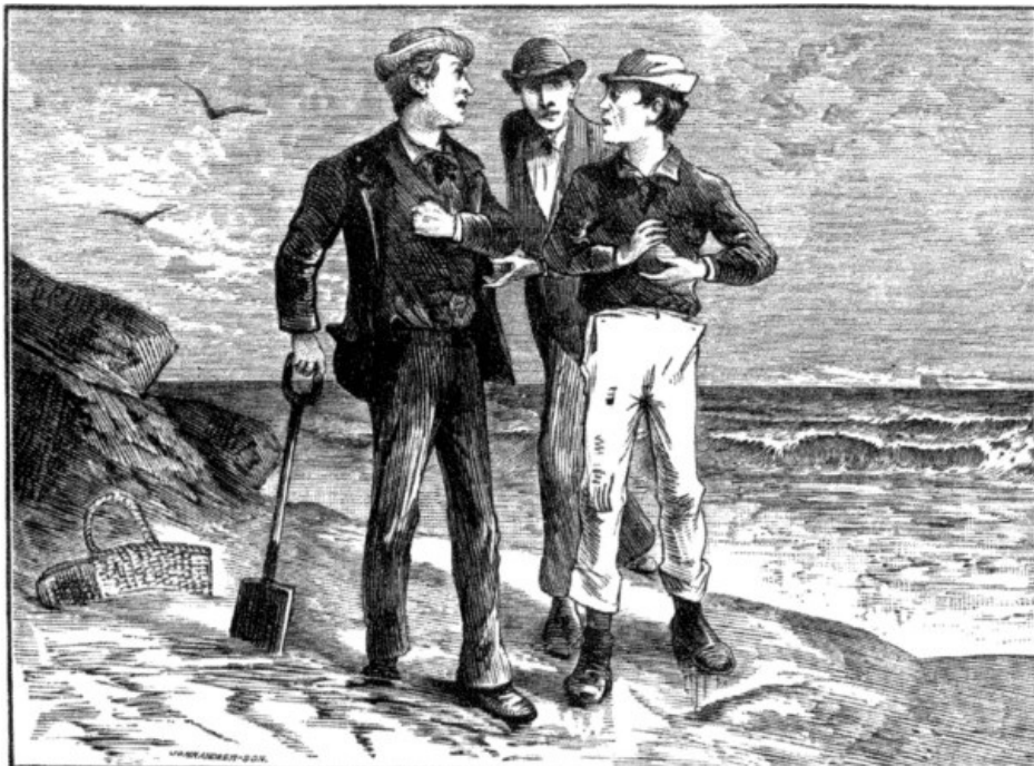
Stumpy with the Bag of Gold. Page 253.

Leopold looked at Stumpy, and smiled significantly.