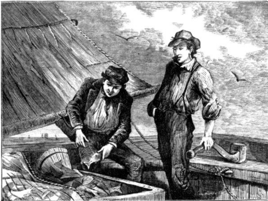
The big Catch of Mackerel. Page 85.

"But if the place is worth two thousand dollars, your mother will get all over the seven hundred, when it is sold," suggested Leopold, who had considerable knowledge of business.