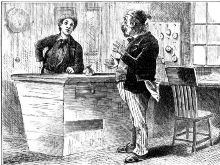
"Donner und Blitz." Page 273 .

As soon as Leopold had landed his passengers, and securely moored the sloop, he hastened, before going to the hotel, to the shop of his uncle. Without any explanation, he dropped upon the watch-maker's counter the shot-bag, in which the gold chinked as it fell, to the intense astonishment of Herr Schlager.