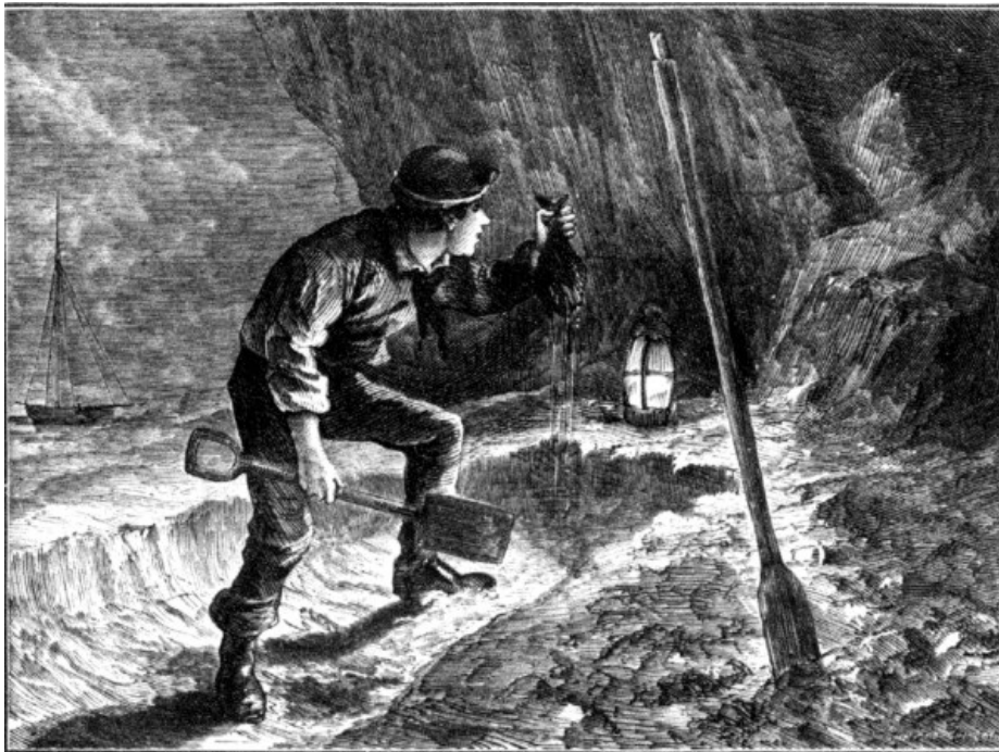
The Money Digger. Page 176.

The bag was just what Harvey Barth had described, and it weighed at least the four pounds and a half Avoirdupois which he had made it by his calculations. Leopold was tremendously excited, as he seated himself on the brink of the hole, with the shot-bag in his hand. [Pg 177]