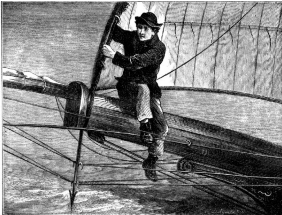
Leopold on the Lookout. Page 213 .

*** START OF THE PROJECT GUTENBERG EBOOK THE COMING WAVE; OR, THE HIDDEN TREASURE OF HIGH ROCK ***