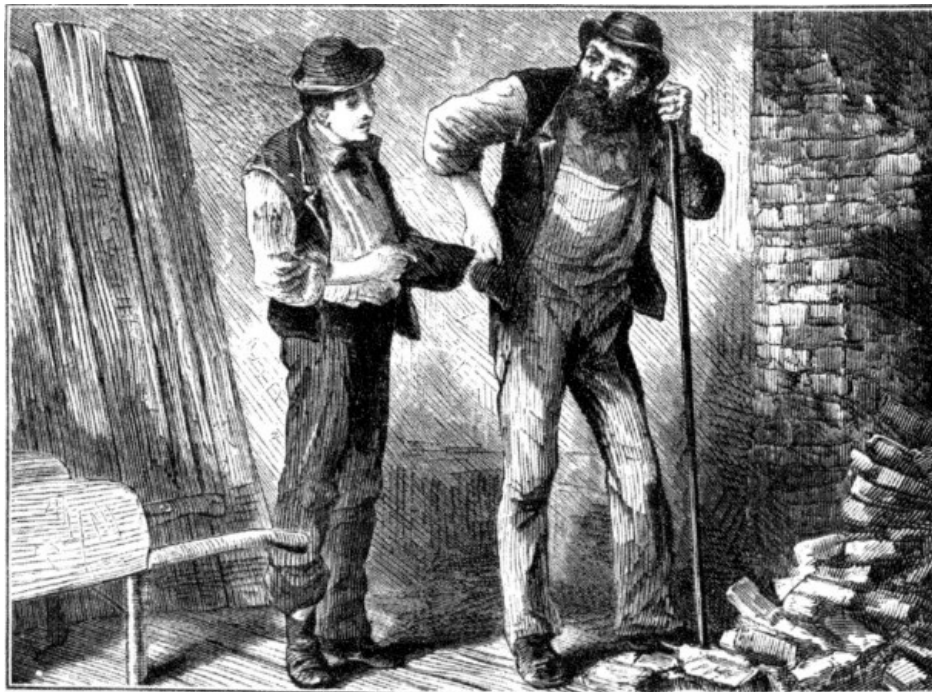
Leopold makes a Discovery. Page 149.

Removing the string from the package, the young man proceeded to unwrap the oil-cloth, shaking the soot and lime dust into the fireplace as he did so. The diary came out clean and uninjured from its long imprisonment in the chimney. Leopold's agitation increased as he continued the investigation, and he could hardly control himself as he opened the book and looked at the large, clear, round hand of the schoolmaster. The writing was as plain as print.