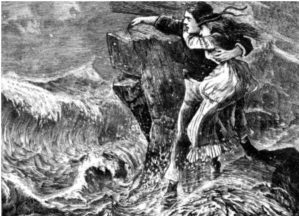
The Coming Wave. Page 345

The tempest increased in violence, and the huge billows rolled in with impetuous fury upon him. Grasping his fair burden in his arms, with Rosabel clinging to him in mortal terror, he paused a moment to look at the angry sea. There was a narrow shelf of rock near him, against which the waves beat with terrible violence. If he could only get beyond this shelf, which projected out from the cliffs, he could easily reach the Hole in the Wall, where Harvey Barth had saved himself in just such a storm. He had borne Rosabel some distance along the beach, both drenched by the lashing spray, and his strength was nearly exhausted. The projecting shelf was before him, forbidding for the moment his further progress.