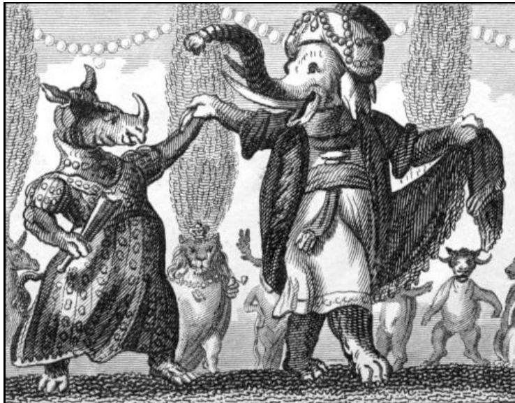
"The Elephant stately majestic & tall." p. 11.