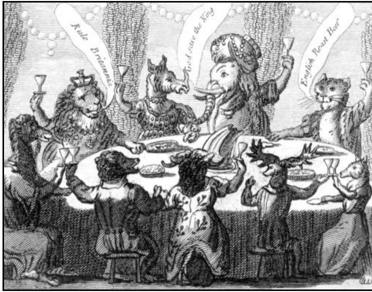
"Rule, Britannia, the Lion sung. &c."