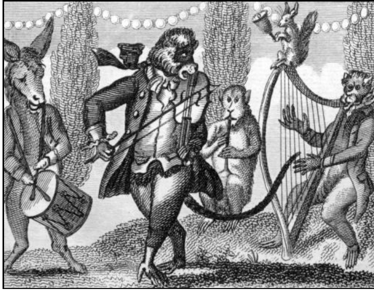
"The Monkey the fiddle delightfully play'd." p. 10.