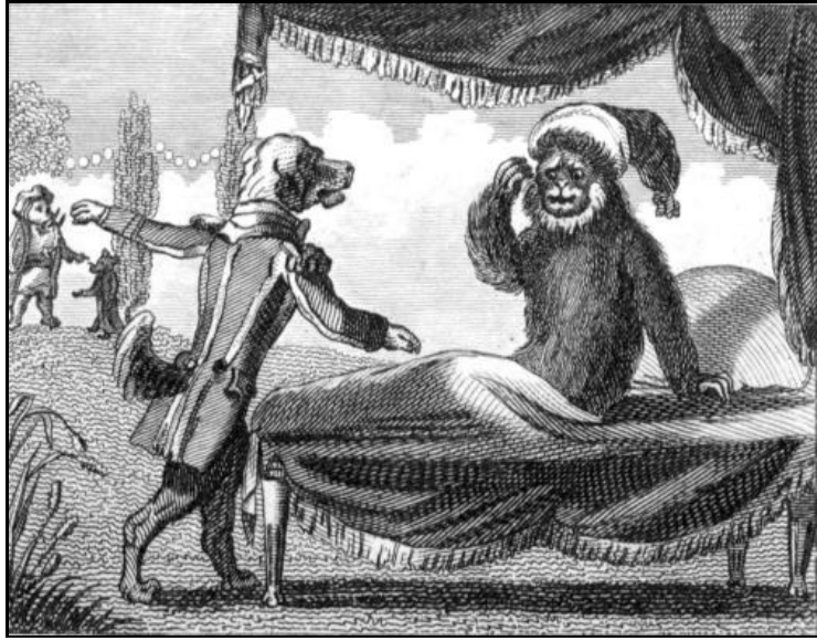
"The Sloth when Invited got up with much pain." p. 7.