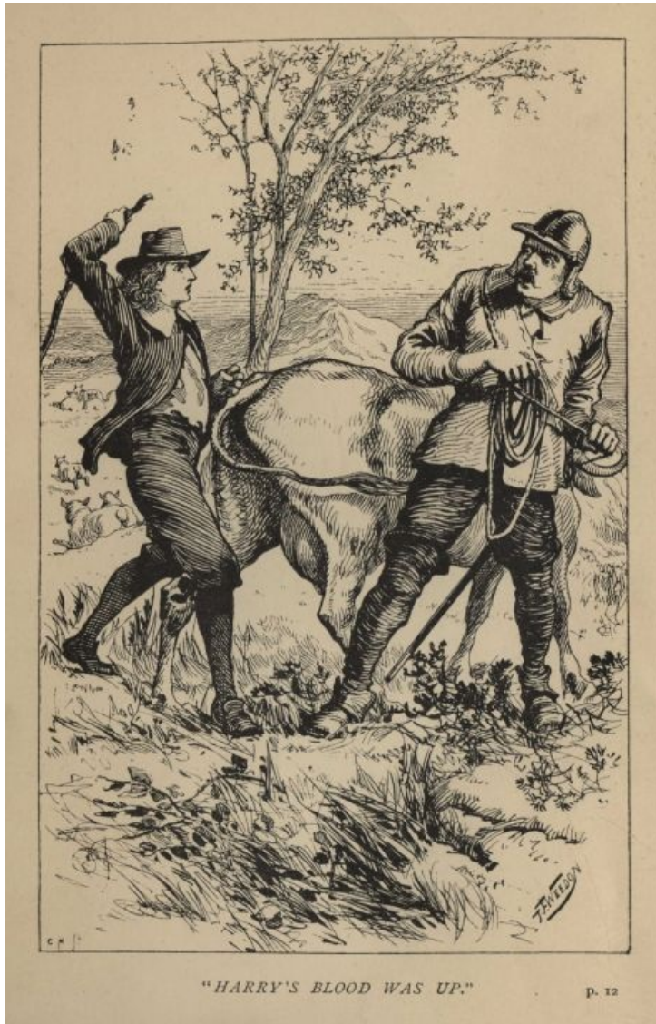
"HARRY'S BLOOD WAS UP." p. 12