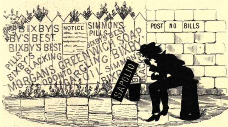
His brow was sad, but underneath, White with "Odonto" shone his teeth, And through them hissed the words, "Well, blow Me tight if here is 'ary show!" "SAPOLIO."