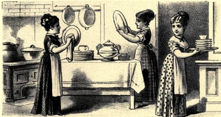
WASH DISHES, PORCELAIN, CHINA & GLASS WARE WITH SAPOLIO.