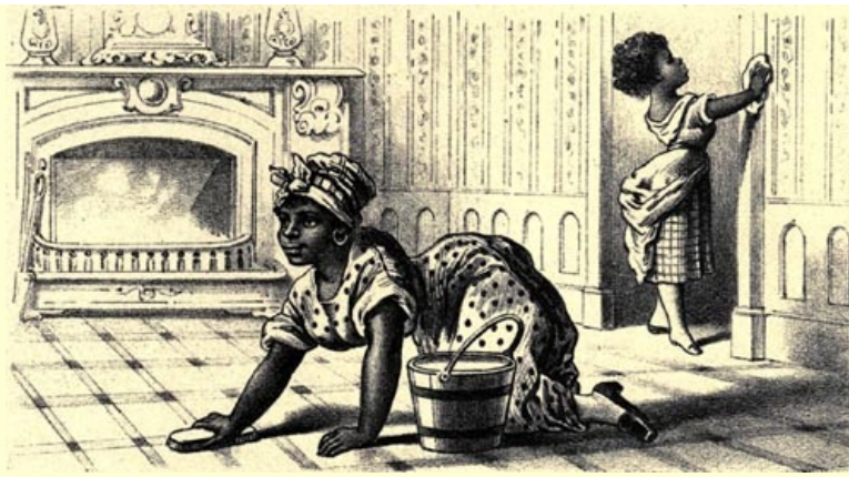
CLEAN PAINT, OIL CLOTHS, FLOORS, WOOD WORK, TABLES & SHELVES WITH SAPOLIO.