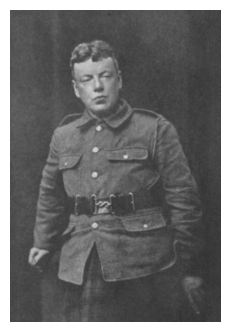
CECIL CHESTERTON