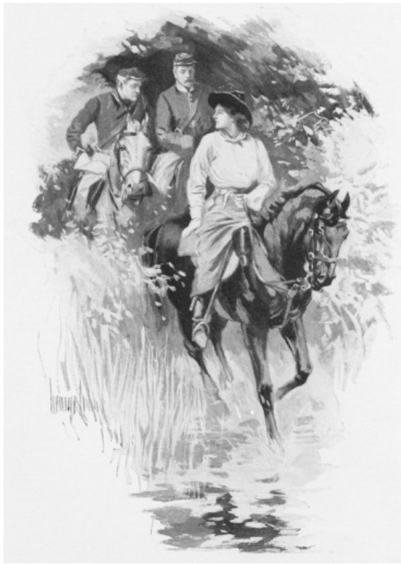
"Daintily her handsome horse set foot in the water." Page 131.