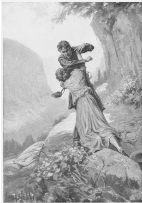
“White-faced, desperate, she clung to him with the tenacity of a lynx.”

So help him God! Something dark and round flew across his line of vision, curving out into space, dropping, dropping into the depths below. A clattering report, a louder racket as the rocky echoes, crossing and recrossing, struck back at the clamoring cliffs.