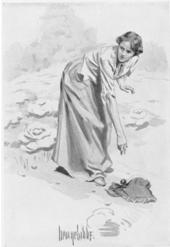
"She dropped her sunbonnet—stooped to recover it."

ventured to lift her eyes. Nobody seemed to be looking her way; the artillery pickets were still watching the pass; the group of officers posted under the trees still focused their glasses in that direction; the young major was already returning across the garden toward her.