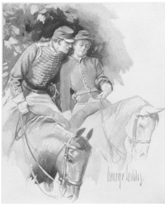
"Yes," she gasped, "The Special Messenger—noncombatant!"

Fringed with darting flames the cavalry drove on headlong into the unseen; behind clanked the flying battery, mounted gunners sabering the dark forms that leaped out of the underbrush; on—on—rushed horses and guns, riders and cannoneers—a furious, irresistible, chaotic torrent, thundering through the night.