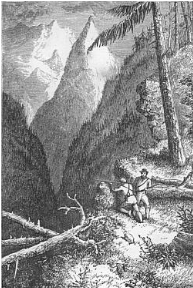
THE TRAPPER SHOOTS HIS DINNER.—P. 77.

This, however, was the last for some time. The trout, ere long, appeared to have settled