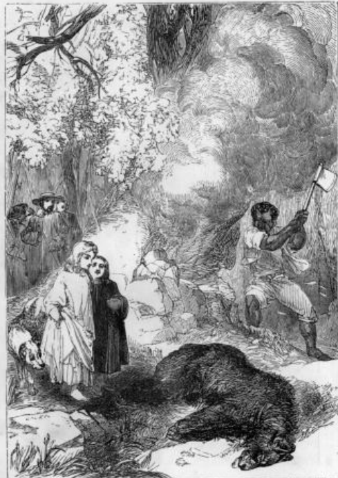
The Bear in the Honey-tree.—P. 300.

“In a few moments we saw that everything was progressing as we had intended it. A blue rope