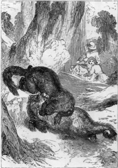
The Marten and the Porcupine.—P. 328.

“In vain the porcupine struggled. The weasel rode him with such agility, that he was unable to get