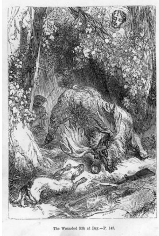
The Wounded Elk at Day.—P. 145.

“For some moments I lay quite helpless where I had been flung, watching what was passing below.