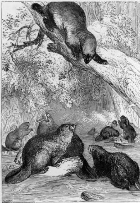
The Wolverine and the Beavers.—P. 185.

“I was curious to see whether the beavers would now return to the breastwork, and I resolved to remain a while longer without showing myself. I waited about five minutes or more, at the end of which time I saw several of them—