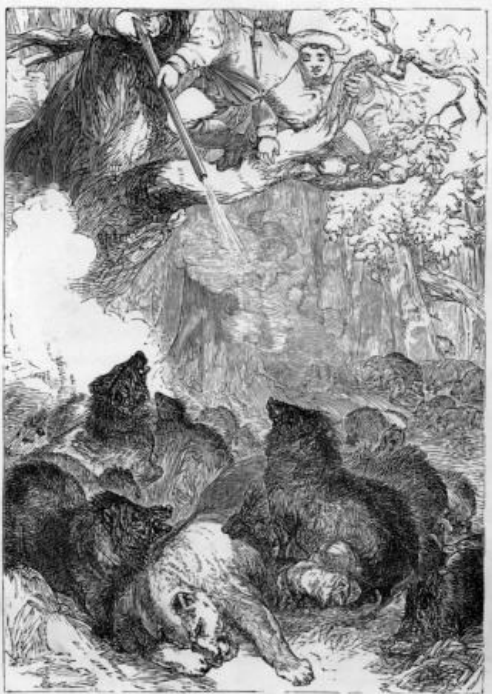
The Enraged Peccaries.—F. 428.

quickly enough to a tree, might fall victims to these fierce creatures. I determined, therefore, at length to try what effect a shot or two might have upon the herd.