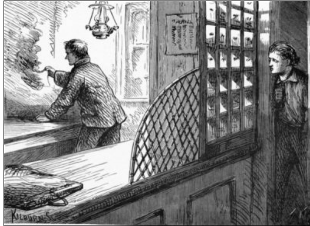
HAM FISHLEY'S CRIME—Page 86.

What should I do? What could I do? I was on the point of rushing into the store, telling him I had seen the flagrant act, and begging him to undo the deed by restoring the money to the letter, and sealing it again. At that instant he lighted a match, and set the letter on fire. I was too late. He took the burning paper in his hand, carried it to the stove, and threw it in. He waited a moment till it was consumed, and then returned to the mail counter. The envelope still lay there; he carried that to the stove, and saw it ignited from the burning letter.