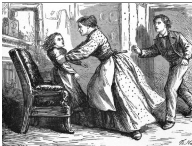
SHE RUSHED TOWARDS FLORA.—Page 22.

As she did not tell me what she should like to know, I did not tell her. I stood upon the defensive between the virago and my sister's chair.