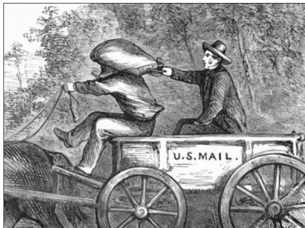
THE SETTLEMENT.—Page 52.