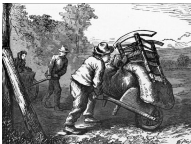
DOWN THE RIVER.—Page 178.

FIRST steps are always full of interest, at least to those who take them; and, as I look back upon the eventful time when our little procession left the back of the barn, it looms up as the most exciting moment of my life, if I except the instant when I was struggling with Sim Gwynn in the water. I was leaving the only home I had known for years, and was going on a strange voyage down the river on a raft. I shall not soon forget the emotions which agitated me.