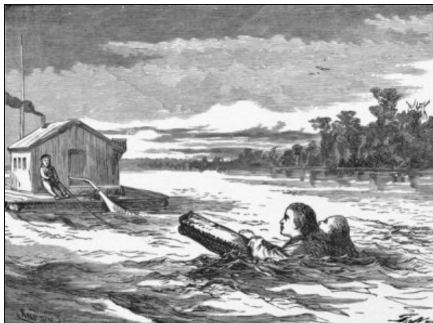
AFTER THE EXPLOSION.—Page 221.

"Hookie!" ejaculated Sim, rushing to the point where I had seized hold of the raft.