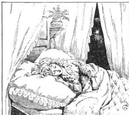
"I THOUGHT OF THE STAR IN THE EAST"