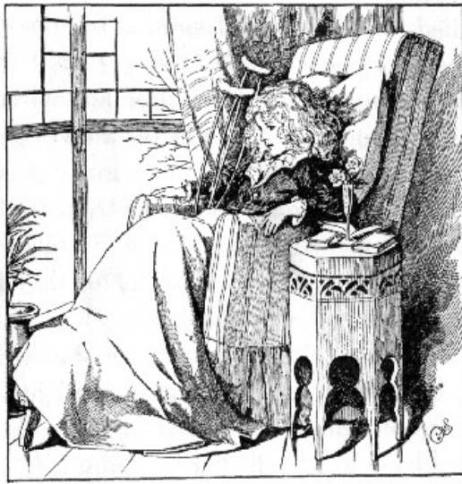
CAROL AT HER WINDOW