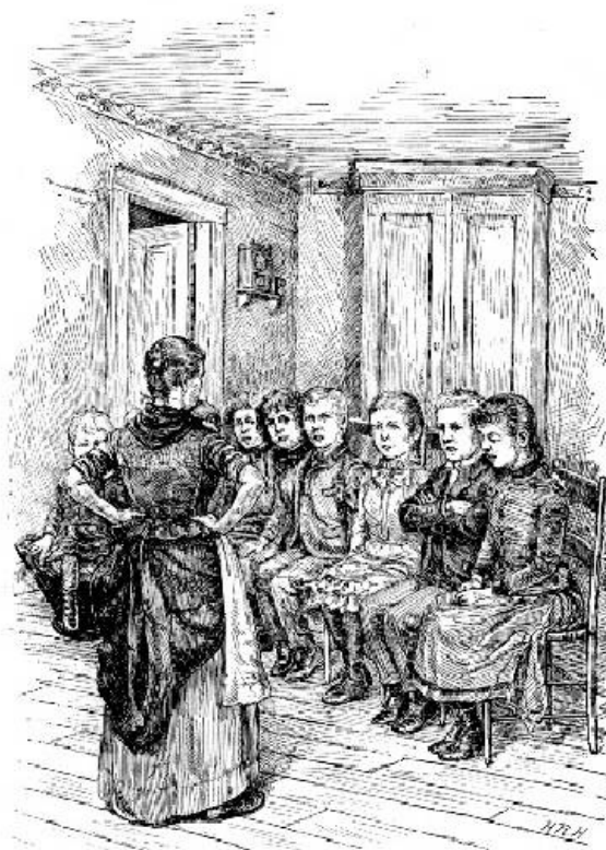
"I WANT TER SEE HOW YER GOIN' TER BEHAVE"

Pile into the bedroom, there, every last one o' ye, 'n' show me how yer goin' to go int' the parlor. This'll be the parlor, 'n' I'll be Mis' Bird."