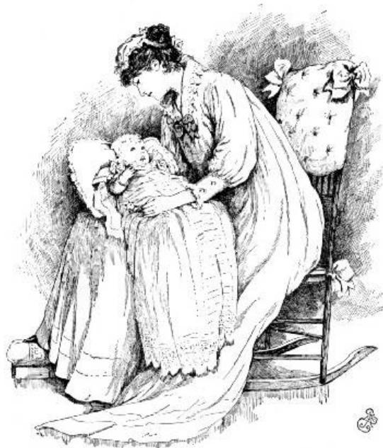
"SHE IS A LITTLE CHRISTMAS CHILD"

Such a generous little creature you never saw! A spoonful of bread and milk had always to be taken by Mamma or nurse before Carol could enjoy her supper; whatever bit of cake or sweetmeat found its way into her pretty fingers was straightway broken in half to be shared with Donald, Paul, or Hugh; and when they made believe nibble the morsel with affected enjoyment, she would clap her hands and crow with delight.