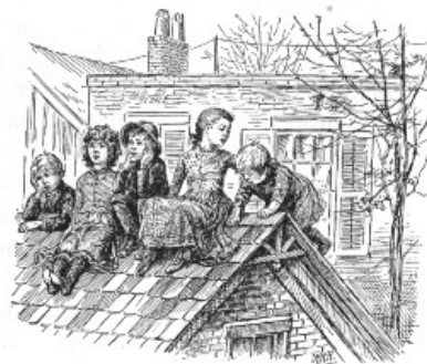
THE "WINDOW SCHOOL"

And when, after dinner, the whole family had gone to the church to see the Christmas decorations, Carol limped out on her slender crutches, and with Elfrida's help, placed all the family boots in a row in the upper hall. That was to keep the dear ones from quarreling all through the year. There were Papa's stout top boots; Mamma's pretty buttoned shoes next; then Uncle Jack's, Donald's, Paul's, and Hugh's; and at the end of the line her own little white worsted slippers. Last, and sweetest of all, like the children in Austria, she put a lighted candle in her window to guide the dear Christ-child, lest he should stumble in the dark night as he passed up the deserted street. This done, she dropped into bed, a rather tired, but very happy Christmas fairy.