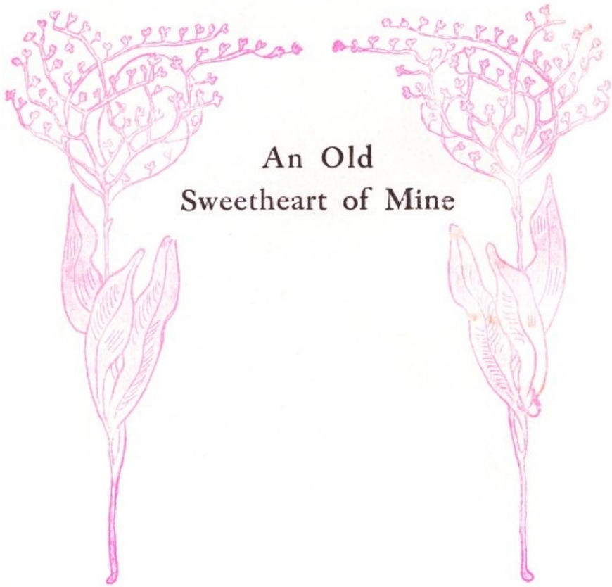
An Old Sweetheart of Mine