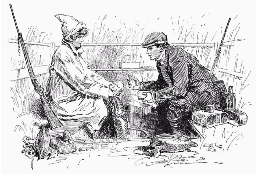
"They ate their luncheon there together."