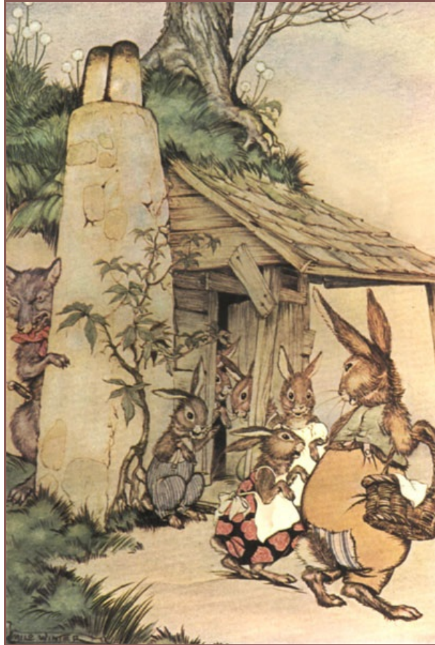
"DE LITTLE RABS, DEY PROMISE DAT DEY WON'T OPEN DE DO' FER NOBODY"

"W'en ole Brer Rabbit git back home, he fine de do' stannin' wide open en all de chilluns gone. Dey wa'n't no sign er no tussle; de h'a'th 'uz all swep' clean, en eve'ything wuz all ter rights, but right over in de cornder he see a pile er bones, en den he know in reason dat some er de yuther creeturs done bin dar en make hash outen he chilluns.