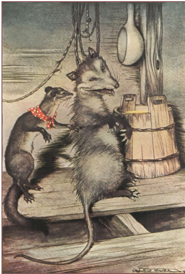
"HE SORTER HUNCH BRER POSSUM IN DE SHORT RIBS, EN AX 'IM HOW HE COME ON"

View larger image Back to List of Illustrations