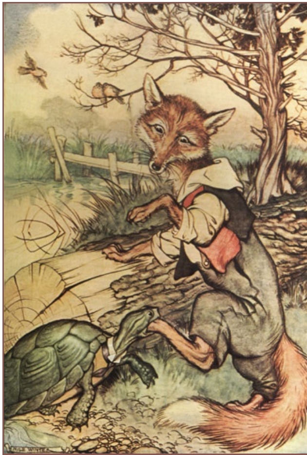
"BRER TARRYPIN. PLEASE LEMME GO!"

View larger image Back to List of Illustrations