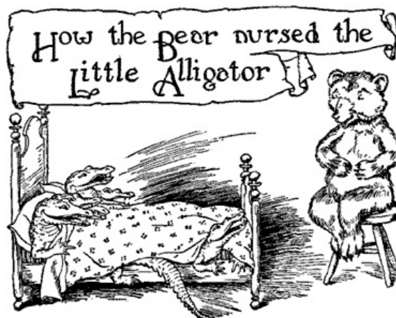
How the Bear nursed the Little Alligator