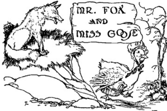
MR. FOX AND MISS GOOSE