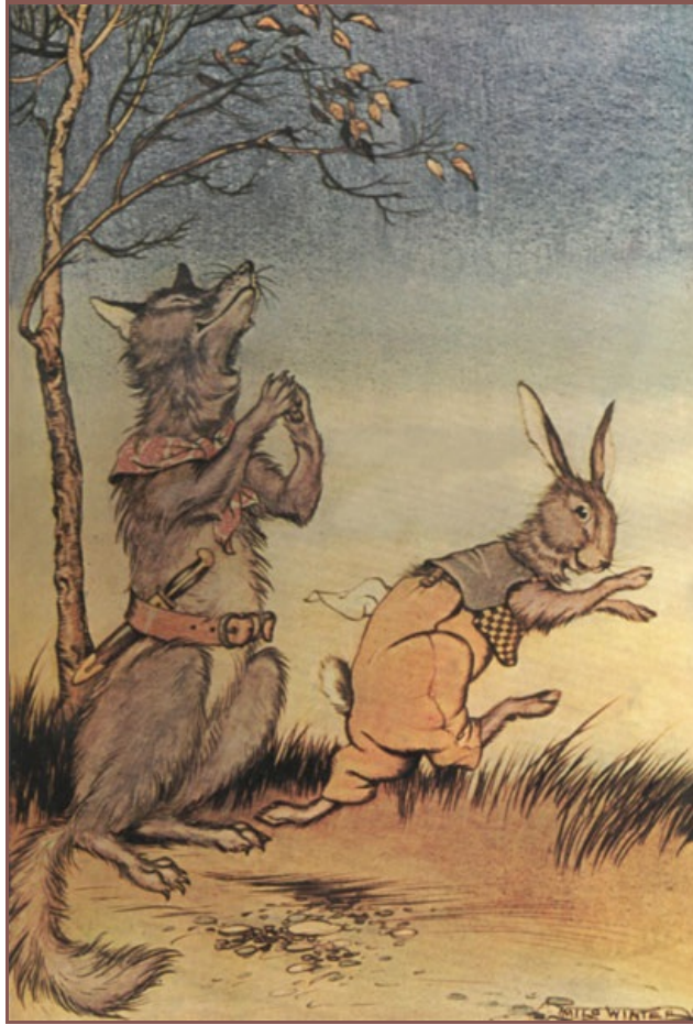
BRER RABBIT FOTCH A WIGGLE, HE DID, EN LIT ON HE FOOTS

"Oh, I just knew Brother Rabbit would get away," the child declared.