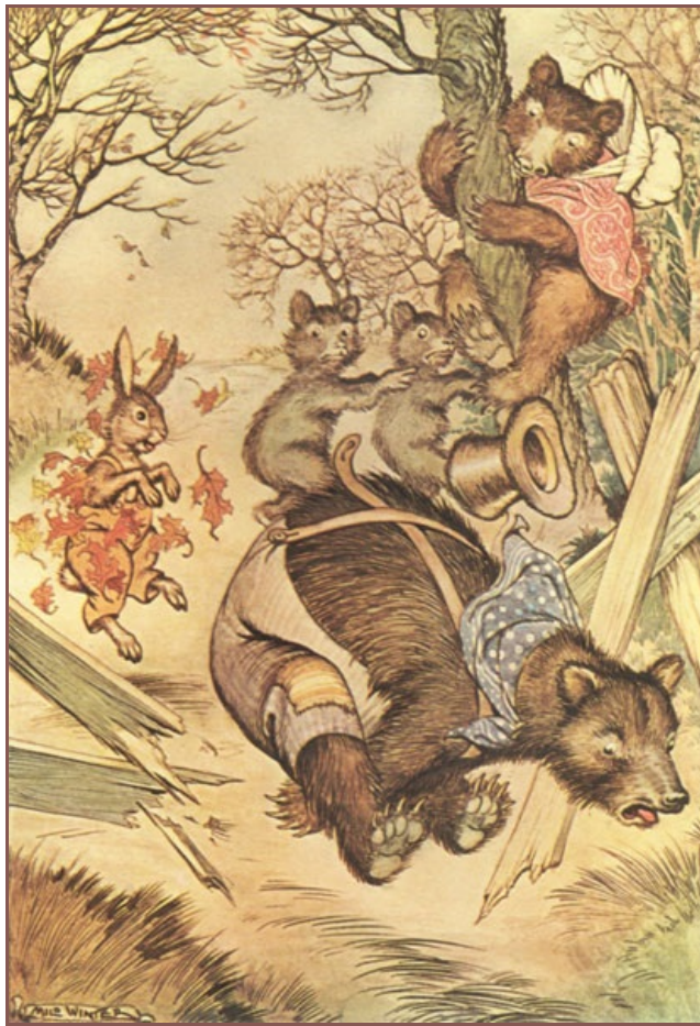
"HE TO' DOWN A WHOLE PANEL ER FENCE GITTEN 'WAY FUM DAR"

View larger image Back to List of Illustrations