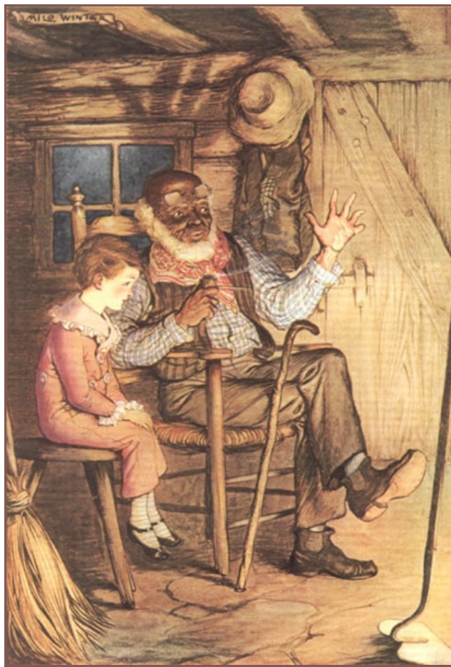
UNCLE REMUS AND THE LITTLE BOY

View larger image Go to List of Illustrations