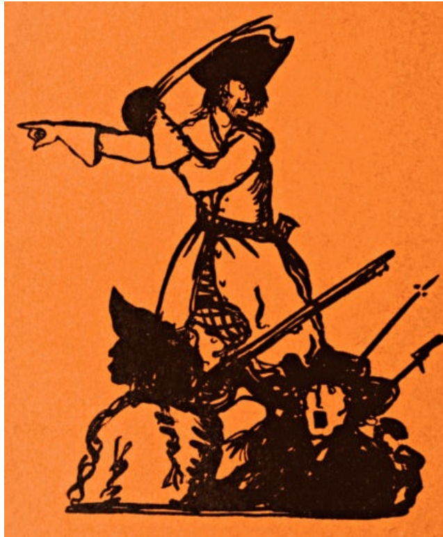
CAPTAIN JOHN RACKHAM