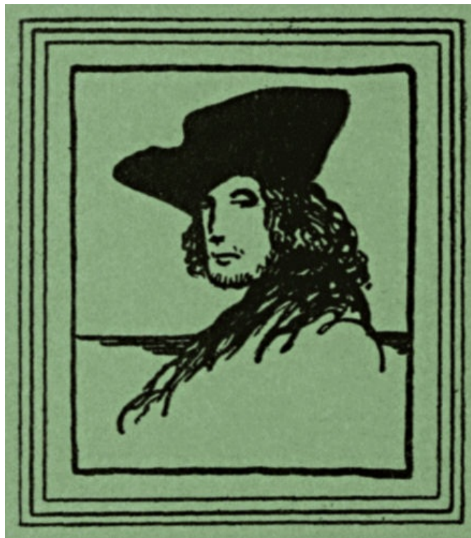
CAPTAIN EDWARD ENGLAND