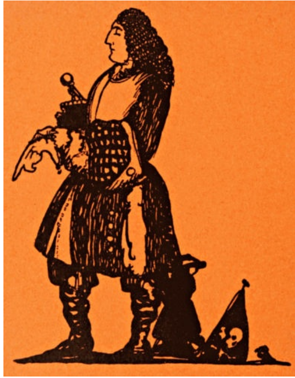
MAJOR STEDE BONNET