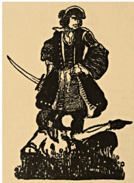
CAPTAIN WILLIAM KID