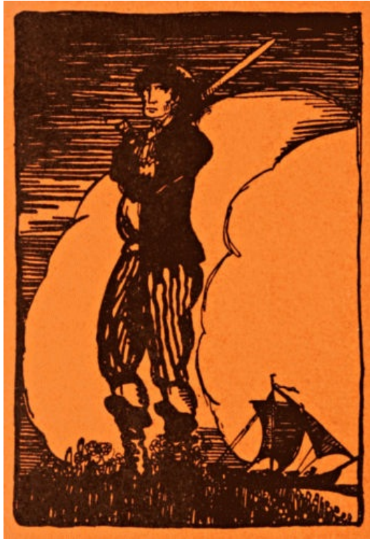
CAPTAIN JOHN GOW