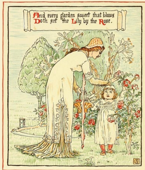
And every garden sweet that blows Doth set the Lily by the Rose.