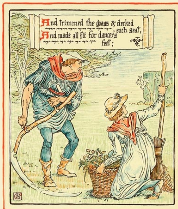
And trimmed the grass & decked each seat, And made all fit for dancer's feet;