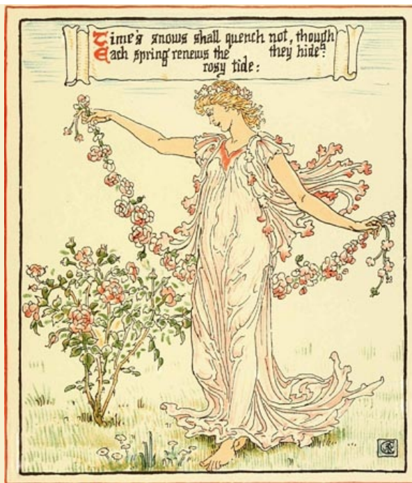
Time's snows shall quench not, though they hide: Each spring renews the rosy tide: