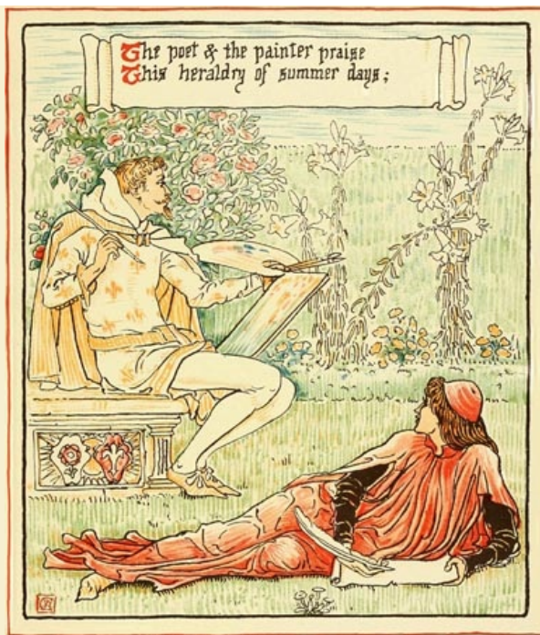
The poet & the painter praise This heraldry of summer days;