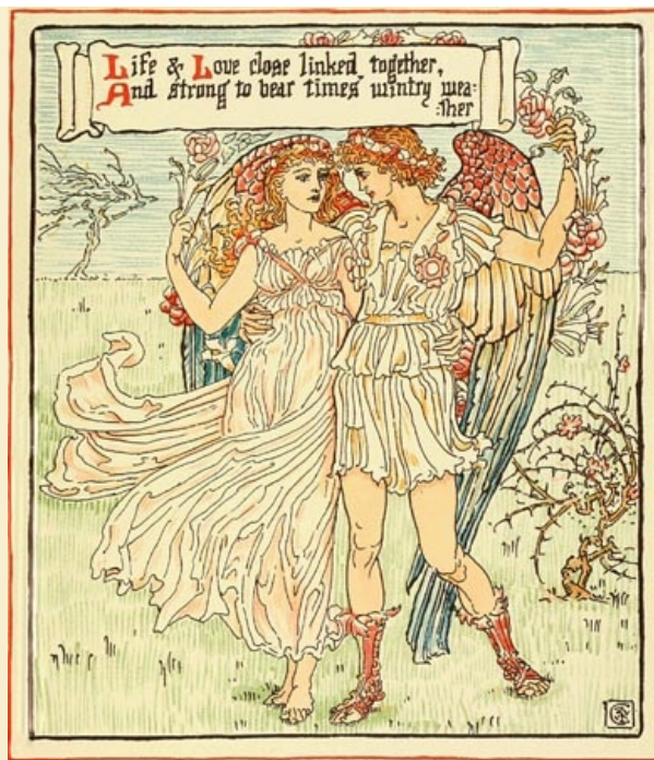
Life & Love close linked together, And strong to bear times' wintry weather