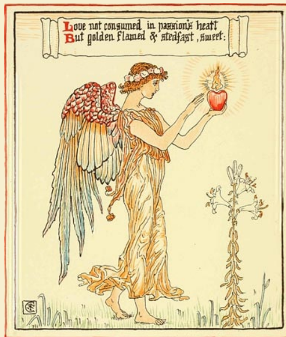
Love not consumed in passion's heat But golden flamed & stedfast, sweet: