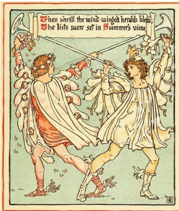
Then shrill the wind-winged heralds blew; The lists were set in Summer's view,