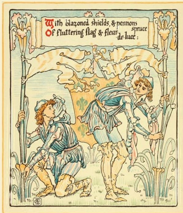
With blazoned shields, & pennons spruce Of fluttering flag & fleur-de-luce: