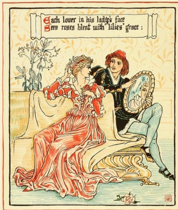
Each lover in his lady's face Sees roses blent with lilies' grace: