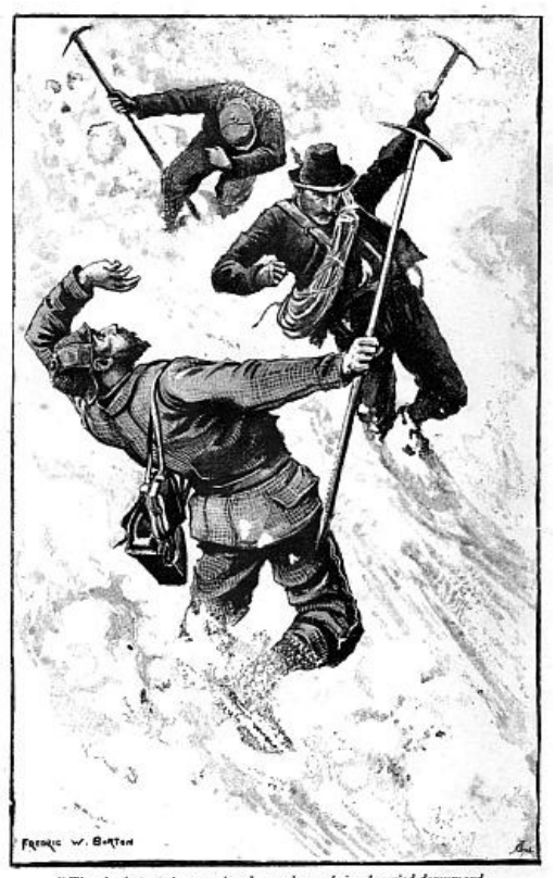
"They had started an avalanche, and were being hurried downward to destruction." [P. 359-

For far above them a dark jagged line had opened across the snowfield, with the dull report they had heard. That crack had begun to widen rapidly, with a curious hissing noise, and the next moment Saxe saw that the vast snow slope was in motion, and that they were being carried by it downward toward the valley, a couple of thousand yards below.