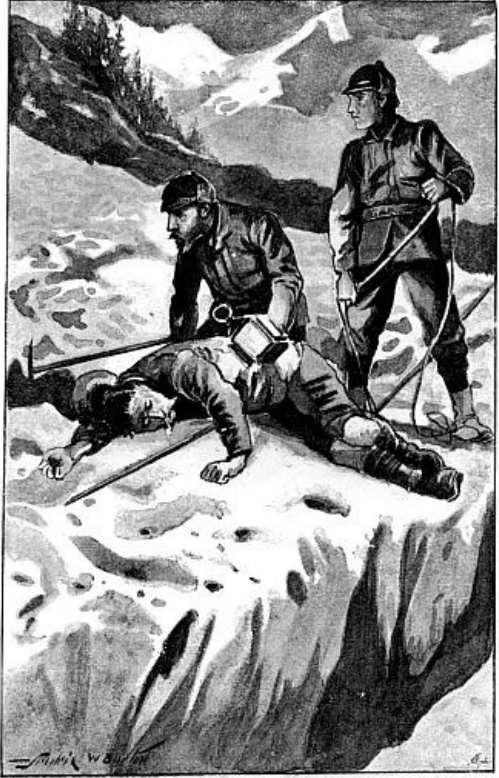
"The next moment the guide lay prone on the ice with the lanthorn still burnin and allached to the waist."

"Both together again!" cried Dale hoarsely; and they dragged him a few yards along the ice perfectly helpless, for he had exhausted himself in that last effort to reach the surface.