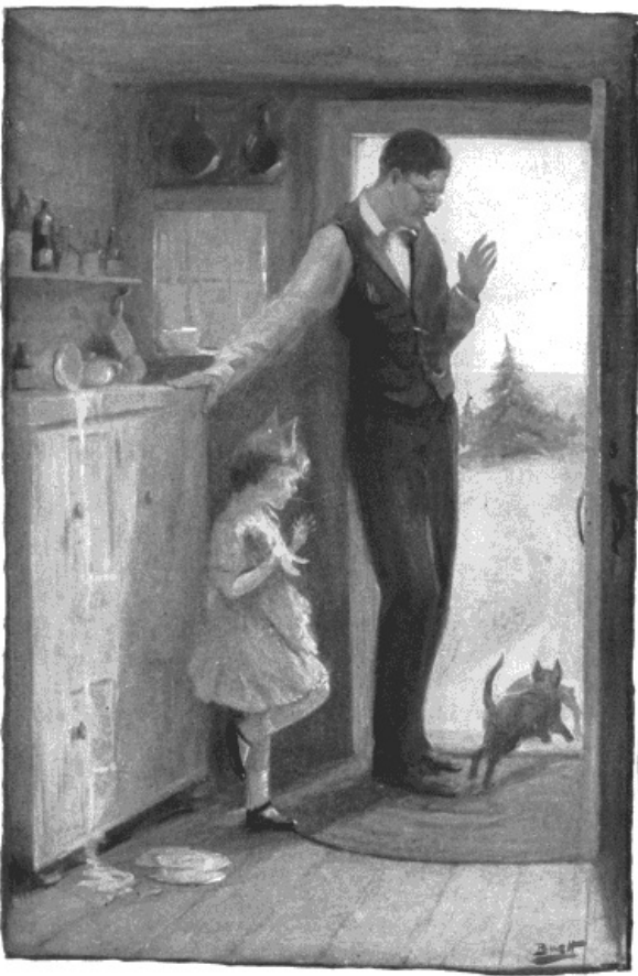
There was a momentary glimpse of a brindle cat with a mackerel crosswise in its mouth

There was a swoop through the air, a scream from Barbara, a crash— two crashes, a momentary glimpse of a brindle cat with a mackerel crosswise in its mouth and the ends dragging on the ground, a rattle of claws on the fence. Then Jed and his visitor were left to gaze upon a broken plate on the floor, an overturned bowl on top of the ice-chest, and a lumpy rivulet of rice pudding trickling to the floor.